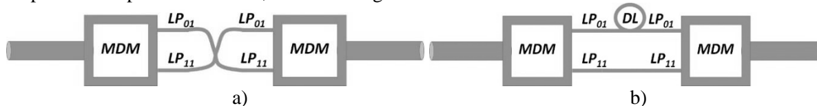
Figure 1. DMD compensating by modes crossing (a) and inserting of delay line (b), b) where MDM – mode division multiplexer; DL – delay line.

In this paper, considered two known methods of DMD compensating [29]. One is the modes crossing (Fig. 1a) and other is the inserting of delay line (Fig. 1b). As noted earlier, DMD compensation were included on linear optical amplifiers. When modes crossing was used, the even number of amplification spans was chosen, and their length was assumed to be same.