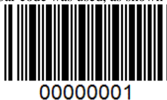
Figure 3. Example barcode used for marking products.

During the experiment, 3 cylindrical objects were taken, on each of which 4 barcodes were attached. For multi-code marking, a Code-11 bar code was used, as shown in Figure 3: