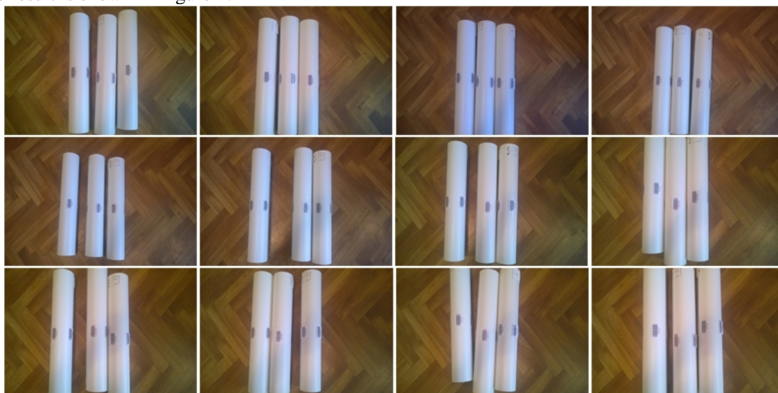
Figure 4. Example of images taken during shooting.

In order to get a more accurate result, you need to photograph as many different cases as possible. The result is shown in Figure 4: