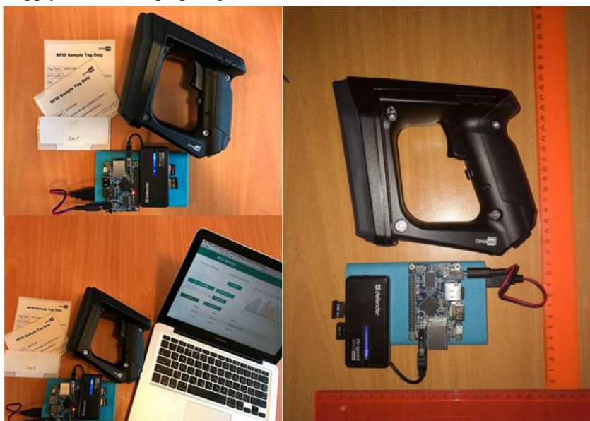
Fig. 1. Type of laboratory prototype.

Laboratory prototype was developed for testing the project hardware industrial products positioning system on the territory of the enterprise on the basis of radio-frequency grid for experimental studies. Laboratory prototype consists of a microcontroller, a manual RF reader, power supply unit and a laptop (Figure 1).