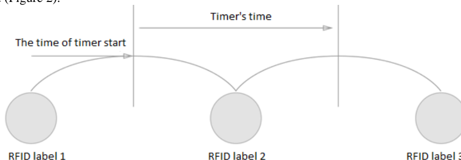
Fig. 2. Is a chart of determination of temporal interval of t .

The algorithm is based on statistical analysis of the number of recognitions of radio frequency tags for certain time periods t . The period of time t is the average period of time during which the transport device is moved from the beginning of the current scan area to the end (Figure 2).