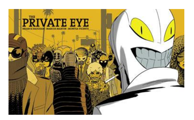
Figure 4. The Private Eye issue 1 cover. [View larger image.]

stories and distributing content direct to fans—ones that eschew leveraging their fame through crowd funding. Look at Joss Whedon's Buffy season 8 comic or Dr . Horrible's Sing-Along Blog Web series, or Brian K. Vaughn's new Web-optimized comic The Private Eye (http://panelsyndicate.com/).