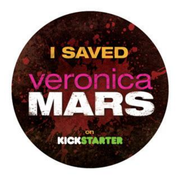
Figure 3. "I saved Veronica Mars on Kickstarter" sticker, one of the stickers offered as a reward for backers pledging $10 or more. [View larger image.]

having fans telling us no, they don't feel exploited, is there value in us as academics and industry professionals telling them that actually, they are? Do things like the VM Kickstarter mean that we need to reevaluate how we study fandom and the language that we use?