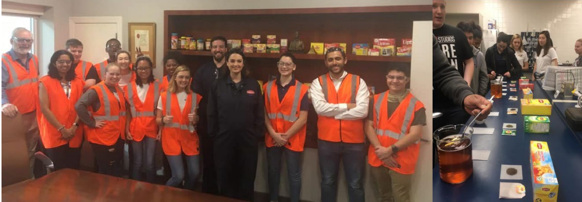
Figure 5: Granby High School field trip to Unilever, Suffolk, VA in 2019

real application of various enterprise management systems that handle data from the manufacturing system, which is used to control this high paced manufacturing facility. Finally, they got to enjoy a small taste test for different types of tea and understood how this taste test is essential for quality control purposes.