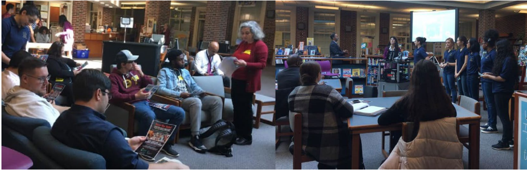
Figure 2. Project kick off at Granby High School Lunch and Learn

The project officially started in fall 2019 and got its “kickoff” with a getting to know each other afternoon at the Granby High School where project team, college students, teachers and students from the high school met in the school’s library. The high school girls’ robotics team introduced themselves and discussed their achievements. Students in the culinary classes treated the guests with in-house lunch. The group of college students were to serve as role models, to answer questions regarding college, and to get to know the high school teams for which they may later serve as coaches.