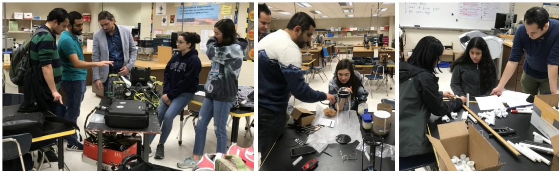
Figure 6: Old Dominion University graduate students and faculty advising Girls in Engineering team

The MATE ROV competition aims to enhance students' technical and entrepreneurial skills, which are in high demand nowadays for job opportunities. These skills include but are not limited to the ability to understand the scope of business operations (such as research and development, finances, and marketing), working as a team, critical thinking, and applying technical knowledge in a creative and innovative way. Granby Girls in Engineering have been participating in this competition for the past several years. Last year, they were able to achieve first place in the Regionals for the Ranger class and they also won the Mart Klein MATE MARINER Award in the internationals. This year, the project team aims to help them achieve a top position in the internationals. When the faculty members of the team first started working with the high school robotics team, they tried to understand the main issues girls' team faced last year so that together they could start the new competition round by analyzing and fixing previous years' problems.