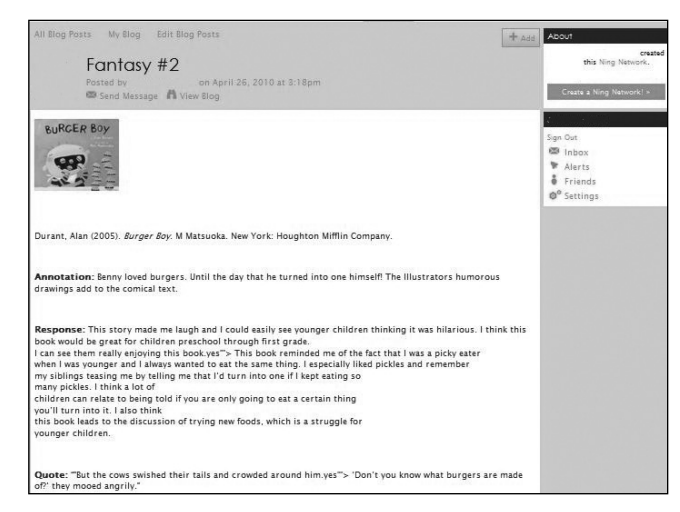
Figure 3. One teacher's blog posting about Burger Boy