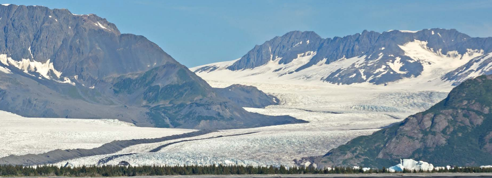
Bear Glacier flowing into the Gulf of Alaska at the mouth of Resurrection Bay near Seward, Alaska.