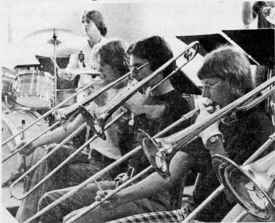
Brass section of MSU Jazz Ensemble rehearsals for homecoming performances.

One of the highlights of the 1976 Homecoming activities will be the Friday evening dance held in Wetherby Gymnasium and the Multipurpose room. As in past years, musical entertainment for this gala event will be provided again this year, by ensembles from the University Jazz and Studio Music Program.