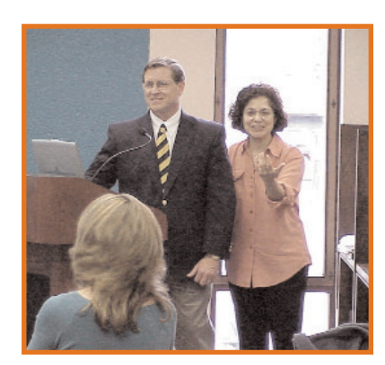
Professor of Linguistics Interaction, Language Typology and Second Language Learning

CSU Libraries hosted the first Research Forum Series in January 2002. During the previous academic year, the Libraries had sponsored a Brown Bag Book Talk Series, which featured talks by CSU faculty who had recently published books. After one of those talks, a faculty member suggested the idea of research forum, since not every faculty member's research ends up in book form. Since