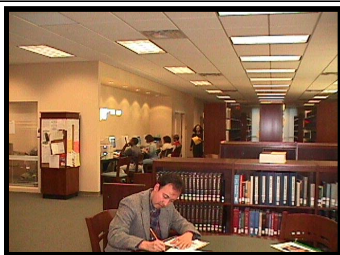
The Music Library today.

compact disc, and analog audiocassette players; CD ROM workstation; a ClearView reader; and a variety of supporting software such as ZoomText and Jaws for Windows, Microsoft Office2000 , Pegasus , and Finale .