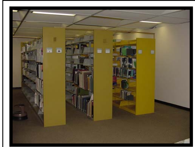
The new closed reserve - more security and therefore guaranteed access to materials by students.

To obtain an item from the reserve area, the student must present a call slip request to a staff member at the Circulation desk. Information required on the call slip is: Instructor's name