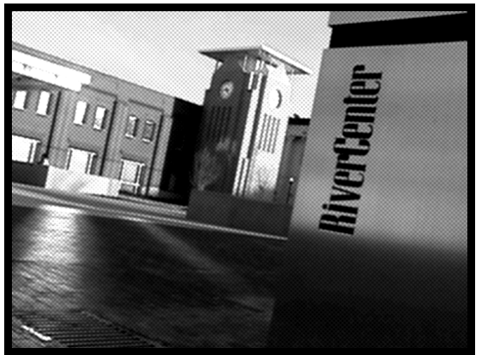
The Music Library is located on the first floor to the left of the clock tower.

Columbus College opened its doors as a junior college in 1958 and became a four-year institution in 1965. The Music Department, founded in 1969, was located in Fine Arts Hall (completed in 1968). As the music department grew to become one of the major programs on campus, it physically overwhelmed its quarters in Fine Arts Hall. Plans began to develop in the mid-1980's to address the music department's need for a larger facility. These plans evolved into the construction of a performing