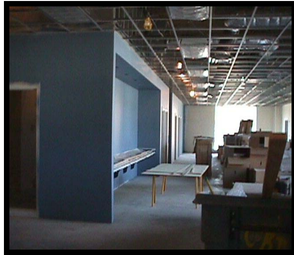
The Music Library . . . barely.

The service desk supports a variety of activities including circulation, reserves, reference and interlibrary requests. Study tables, carrels, a reading room, a video viewing room, and a collaborative learning room provide patrons with separate areas for the many types of activities supported in the branch. Patrons have access to networked computers and printer; a photocopier; microform reader/printer; videocassette players; a DVD player; LP,