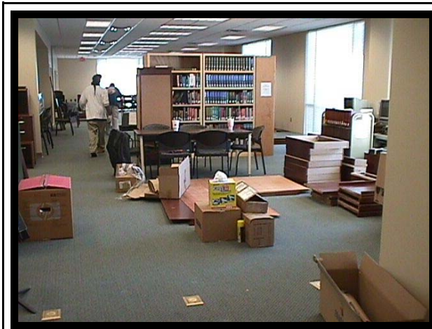
Furniture and shelving begins to add character.