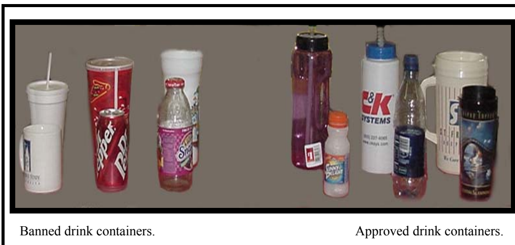
Banned drink containers.