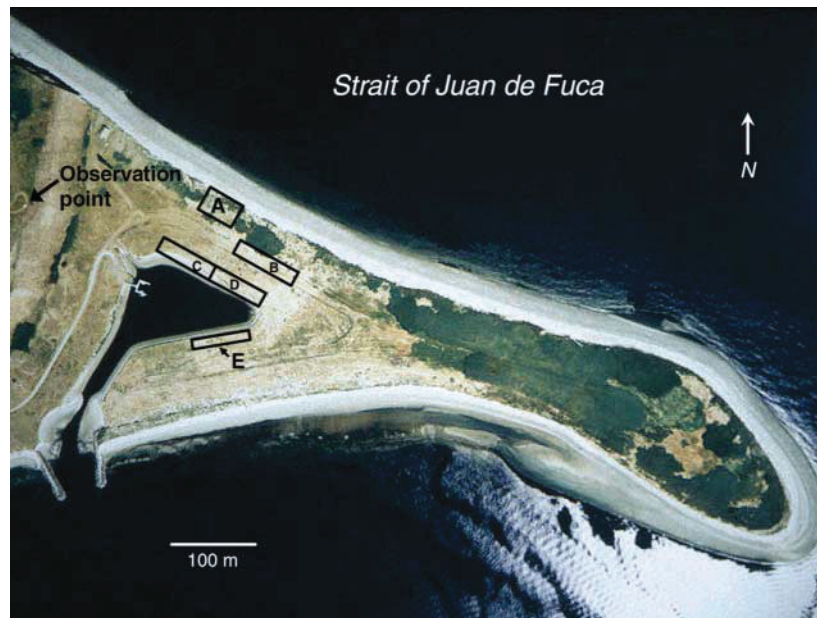
Figure 1. Sample Areas A–E in the colony on Violet Point and the observation point at the west end atop the 33 m bluff. The larger colony extends throughout most of the spit.