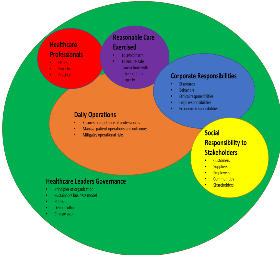
Figure 1. Due Diligence Conceptual Application to Healthcare Leaders

a transaction with another party (Violette & Shields, 2007). The concept of due diligence applies to organizations and leaders who seek to provide a safe and effective workplace environment. The basic concept of due diligence in this context extends the idea of safe practice linking healthcare leaders, healthcare professionals, and healthcare organizations. Figure 1 presents the interrelationships of the ethical and legal aspects of due diligence as applicable to healthcare leaders.