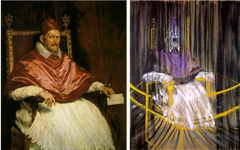
Figure 1 (Saleh et al.)