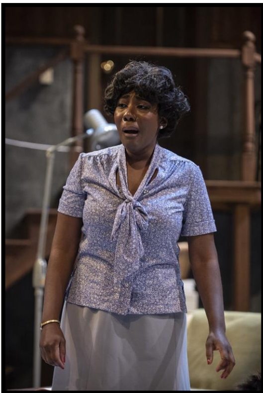
Figure 6. Act 2 Scene 4, Chelle learns of Sly's death.