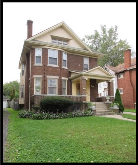
Figure 1. A Detroit home in the northern Boston-Edison neighborhood.