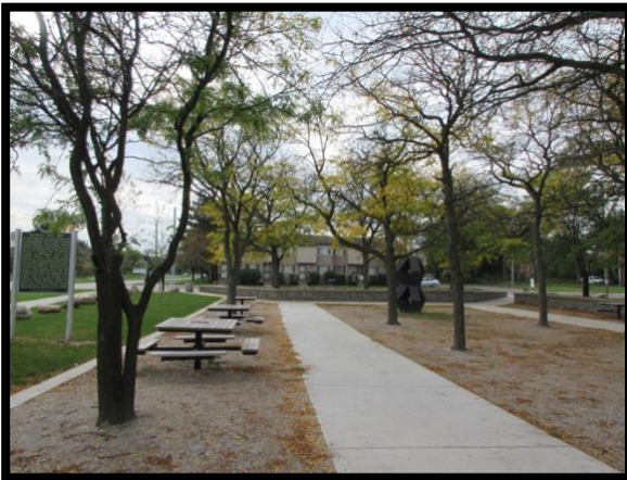
Figure 2. Former location of the “blind pig” police raid July 23, 1967. It is now known as Thomas Gordon Park.