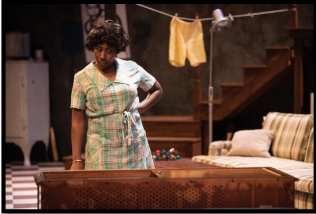
Figure 5. Opening Scene with Chelle and her record player.