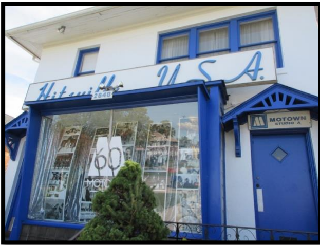
Figure 4. Façade of the studio and offices of Motown Records in Detroit.