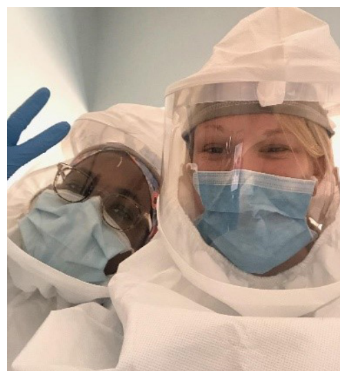
Figure 3. Critical Care Anesthesia team members wearing PPE.

elective procedures, however delivery and Cesarean section (C-section) rates continued at pre-COVID levels. Anesthesia continued to perform neuraxial anesthesia (epidurals and spinal) and general anesthesia support (also known as OB Anesthesia); our total number of procedures continued unabated.