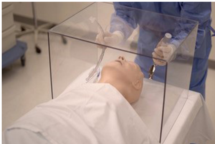
a. Intubation barrier device in simulation model