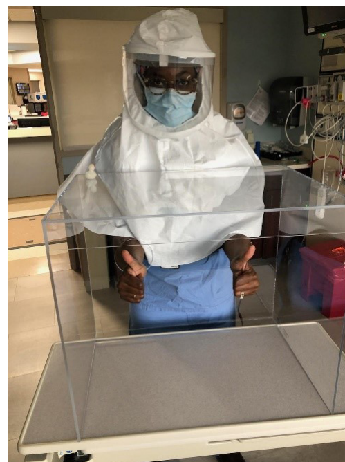
b. Intubation barrier device display