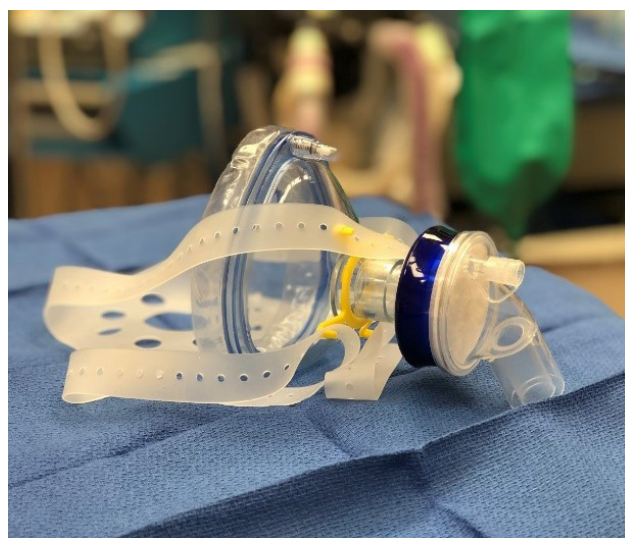
Figure 2. Mask-Shift Elastomeric Masks w/ HEPA Filter.