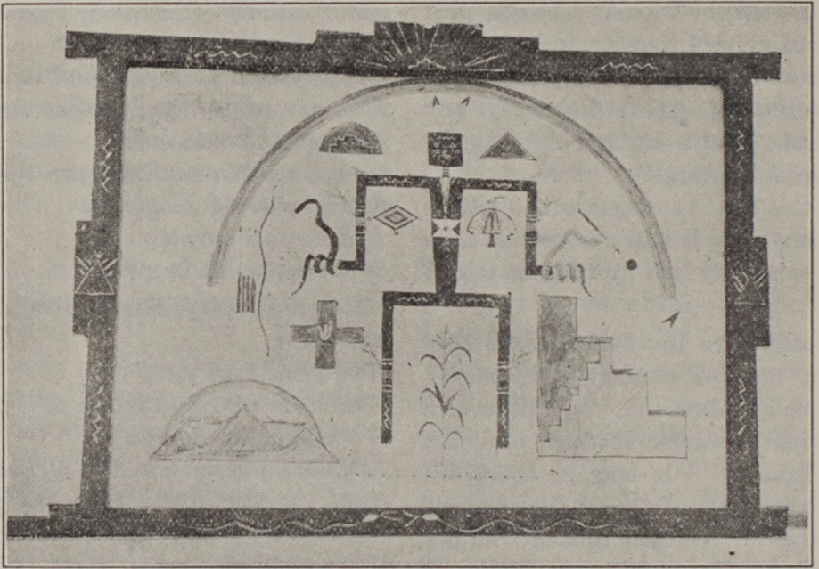
Painted by a Navajo artist, from the sand-painting of a Shamen, made at the birth of a Navajo child. It is symbolic of the child's life.