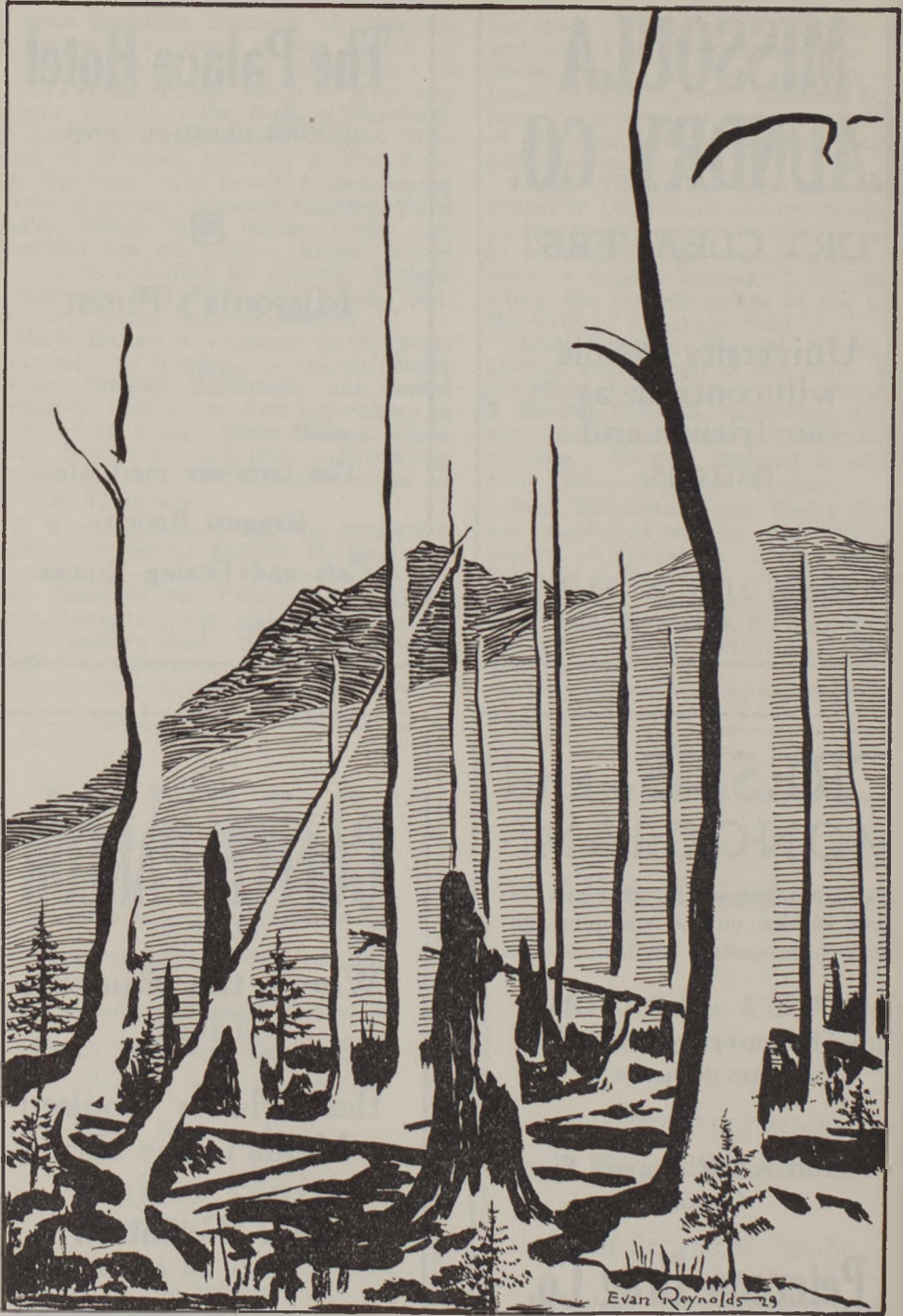
Illustration for THE RECORDERS by Evan Reynolds