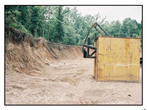
Figure 14. Shield Before Blast

The shield was mounted on cantilevered beams welded to a heavy metal structure to hold it in place for the test. The shield was mounted so that the height above ground matched the height of the actual shield installed on the tractor. The shield was placed 4.0 meters from the base of the 3 meter high embankment shown in figure 14. A 14.0 kg explosive charge TNT equivalent was placed at the base of the embankment to replicate the blast of a very large antitank mine detonating in the trench wall facing the excavator.