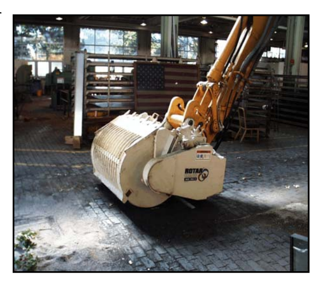
Figure 3. Rotar Sifting Bucket

The HEX 700 model used on the Sifting Excavator has a capacity of 650 liters and fully loaded weight of 1850 KG. The Rotar hydraulic system was custom designed for this application by Rotar Inc. according to Night Vision specifications to make the system compatible with the Shinn HPU and Liebherr controls. The Rotar is manipulated with the existing Liebherr controls; in addition, the mechanical locks which control the opening and closing of the bucket are integrated with the Liebherr control system and operated from buttons on the operator's left joystick. The power for spinning the cage is supplied by the Shinn HPU and rotational speed is controlled from the Shinn system joystick on the operator's right side. The mechanical interface with the excavator will permit the Rotar to be mounted for either forward scooping (away from the vehicle) or rearward scooping (toward the vehicle). For use consistent with the operation concept, the Rotar faces away from the cab, and the operator uses a forward stroke to pick up the residuals in the bottom of the trench against the trench wall.