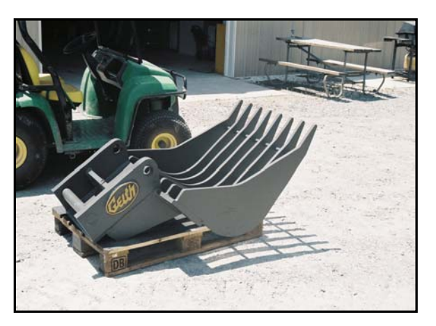
Figure 1. Vaned Bucket

In addition to the standard quick release digging bucket, four special purpose tools have been designed and fitted for use with the Sifting Excavator. Three of these require a hydraulic power source to separately power the attachment. The one tool not requiring hydraulic power is the Vaned Bucket (see Figure 1) which is to be the main excavating tool employed. The Vaned Bucket fits on the excavator arm and curls outward, away from the vehicle in contrast to standard digging tools made for the excavator. This action is required to pick at the base of the trench wall facing