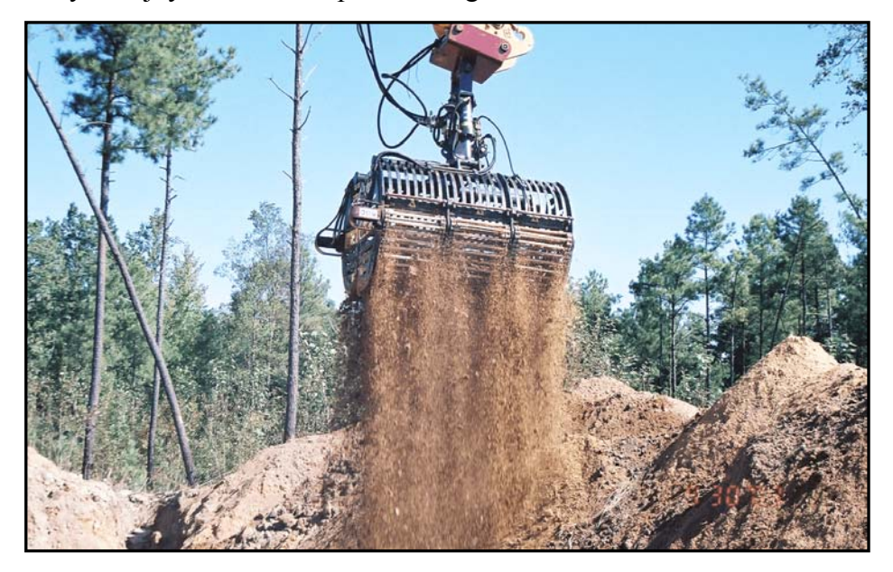
Figure 5. Bertani Sifting Bucket

area (figure 5). The Bertani FBS 1500 used on the Sifting Excavator has a capacity of 1500 liters and weighs fully loaded 1770 KG. Because of the larger volume and the more aggressive sifting action, the Bertani is capable of reducing piles faster than the Rotar, however it does not pick up material as cleanly, nor does it have provision for retaining all materials inside the bucket until the sifting action has begun. This can be a problem when trying to clean the trench completely and when moving from the excavation location to the sifting location. The Bertani Bucket is manipulated with the existing Liebherr controls, and the opening and closing of the clam is integrated with the Liebherr control system and operated from buttons on the operator's left joystick. The power for running the sifting belt is supplied by the Shinn HPU, and belt speed is controlled from the Shinn system joystick on the operator's right side.