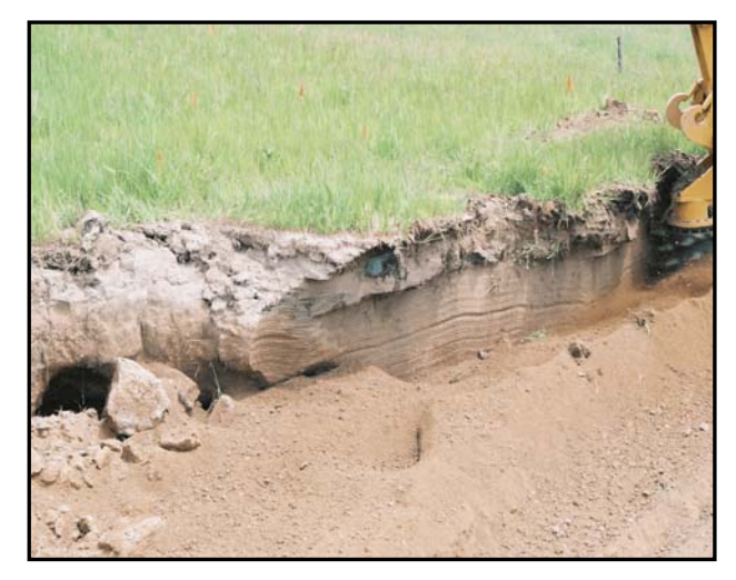
Figure 11. Mine Exposed in Bank with Vertical Mill

Comments on Vertical Mill Results with AT Mines