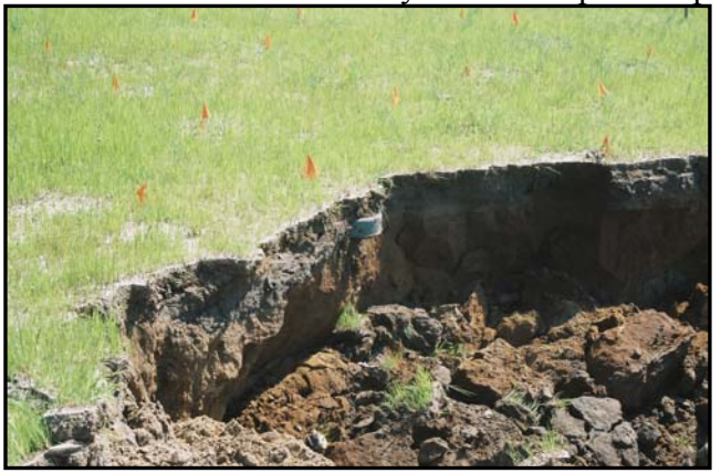
Figure 9. AT Mine Exposed In Bank

Appendix 1 maps the location of each mine and records the observations made as each mine was excavated, retrieved, and examined/tested for functionality. In the operational procedure planned for the Sifting Excavator each mine encountered would have 3 separate opportunities to be visually detected and recovered. The first is when the face of the trench is excavated and the mine is left exposed in the face as in figure 9. The second is when a portion of the bank collapses and the mine is visible in the spoils at the base of the mined face. The third opportunity is when the pile is picked up by one of the sifting buckets. Best practice would demand that a given mine be recovered at the first opportunity at which the mine was visually detected. For the purposes of gathering information on the efficiency of each step in the process, AT mines which presented