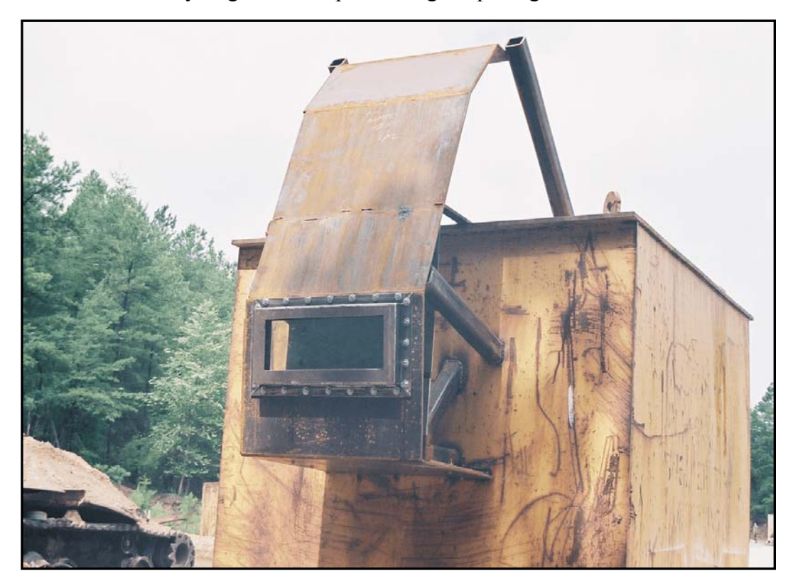
Figure 13. Blast Shield

distance approximately 1 meter. The lowest plate on the columns was 0.5 inches thick (12.7 mm), the second plate was 0.25 inches thick (6.4 mm), the third plate was 0.125 inches thick (3.2 mm), and the top plate was 0.0625 inches thick (1.6 mm). The purpose of the plates was to provide evidence of the destructive strength of the blast behind the shield as well as any fragmentation penetrating or spalling on the interior of the shield.