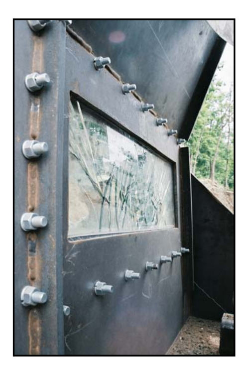
Figure 19. Interior of Glass After Second Blast

The shield was blasted a second time with conditions identical to the first. As can be seen from figures 19 and 20 no further damage was done to the shield beyond additional cracking of the glass and further bending of the 1.6mm and 3.2 mm witness plates.