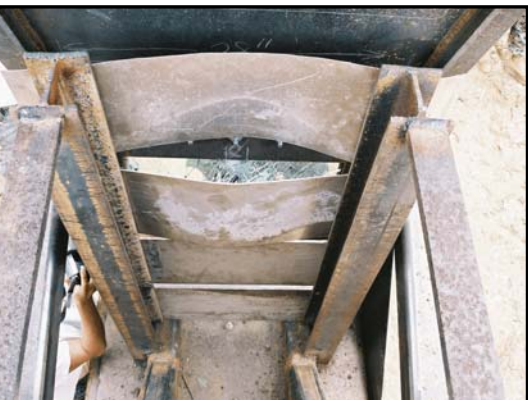
Figure 17. Witness Plates Before Blast