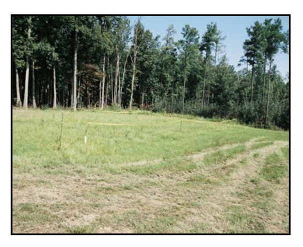
Figure 21. Blind Test Minefield

The proof of concept test was performed in a randomly laid, mixed minefield. Procedures similar to those which might be used in an actual mine clearance operation were employed and the operators had no knowledge of the mine locations. The same mine simulants as were used in the practice area were employed in the blind test: smoke fuzed antitank mines, PMN size/weight replicas, and PPMiSrII size/weight replicas. The size of the mined area measured a little over 12 by 28 meters. The mine locations within the field were randomly assigned and 50 of each type were emplaced. The antitank mines were buried 10 months in advance of the test to