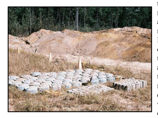
Figure 24. Mines Recovered In Blind Test

The tight development schedule compressed a great deal of work and testing into a rather short timetable and precluded the extensive test each of the individual tools developed for this system deserves. Overall, the process which was developed produced an extraordinarily reliable means of dealing with the mine threat. Of nearly 250 test mines buried, only one mine remained unaccounted for at the conclusion of the test, and this situation is believed to have resulted from poor inspection of the residuals pile rather than