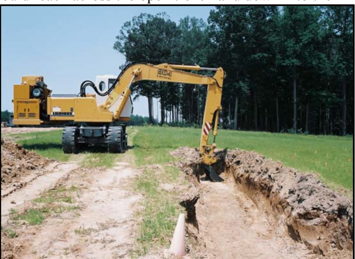
Figure 7. Working Across Trench

hole to perform the excavation (figure 7). The undercarriage was positioned parallel to the long dimension of the trench so the excavator could continually drive straight along the wall of the trench as the operator progressed down the length of the hole. The digging was performed with the undercarriage positioned approximately 1.2 -1.4 meters from the edge. Multiple passes made in this manner widened the trench to 5-6 meters at which point the excavator could no longer reach across.