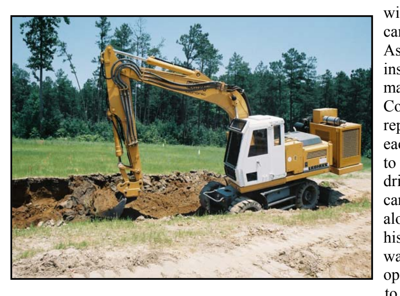
Figure 8. Working Inside Trench

The digging bucket was again used to further excavate the safe side until the trench width was 7.5-9 meters and the excavator could drive down in the trench and have sufficient