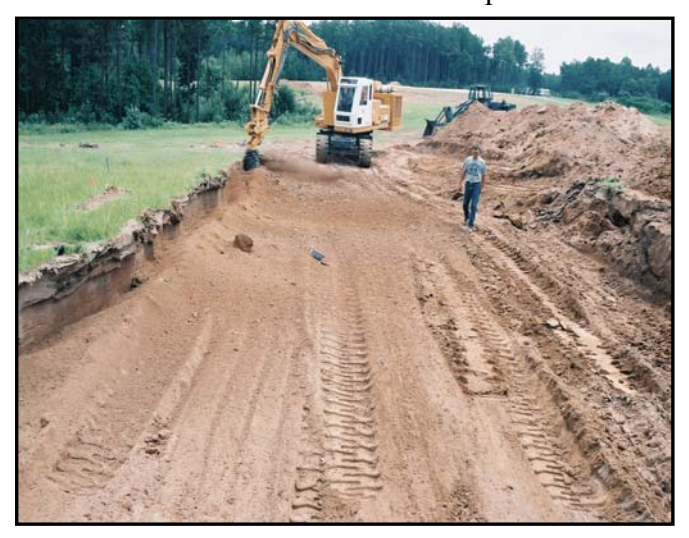
Figure 12. Vertical Mill Completing a Rearward Pass

path of the excavator. A forward stroke, on the other hand, produces a very well behaved pile which lays in tight against the wall. The disadvantage to moving in this direction is a slower cut and a perceived rougher treatment of the mines since they must be pushed deeper into the bank for 1/4 of a revolution before movement toward the free surface for another 1/4 of a revolution. Mainly owing to the better dispersion of excavated soils, the forward stroke was chosen as the preferred direction for the majority of the testing. It is possible to envision a usage SOP with very tight monitoring of the