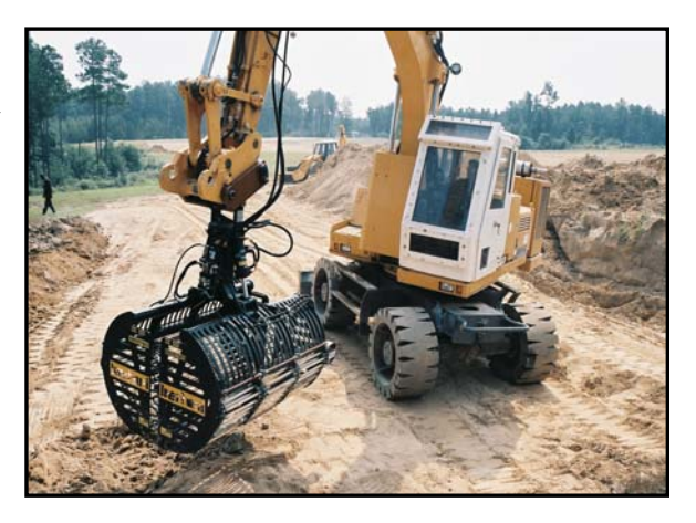
Figure 4. Bertani Sifting Bucket

The second sifting implement for the excavator is the Bertani Bucket, originally designed and sold commercially by Bertani & Donelli of Castelnovo Sotto, Italy for harvesting beets. The Bertani Bucket hangs from the end of the excavator boom and opens like a clamshell bucket for picking up loosened soil in a pile (figure 4). When the clamshell is closed, the operator activates the sifting action which consists of moving, slotted belts in the bottom of the bucket. Soil passes through the slots in the belts and mines and other large objects are retained and emptied in an inspection