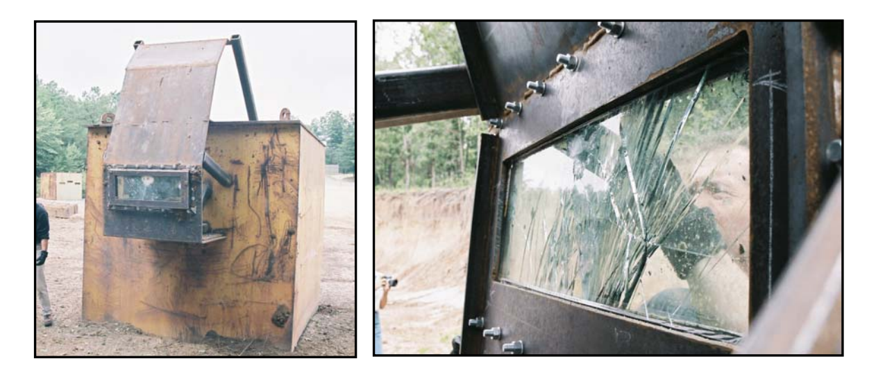
Figure 15. Shield After Blast

Figures 15 and 16 show the effects of the blast on the shield. The outer surface of the shield was pitted with impact marks from flying debris but none of the fragments penetrated the thickness of the metal more than 0.5 mm. There was no perceptible deformation to the shield structure or cracks visible in the surfaces. The glass cracked extensively and two rock fragments embedded in the outer surface. No evidence could be found of any materials penetrating through the glass. An icecube sized chunk of glass did spall on the inner surface; however the evidence suggests that it came off at low velocity. There were no scratch marks on the soft aluminum witness plate directly behind the glass surface, less than 0.2 meters away. The glass chunk itself was lying intact about 0.1 meter from the spot where it originated.