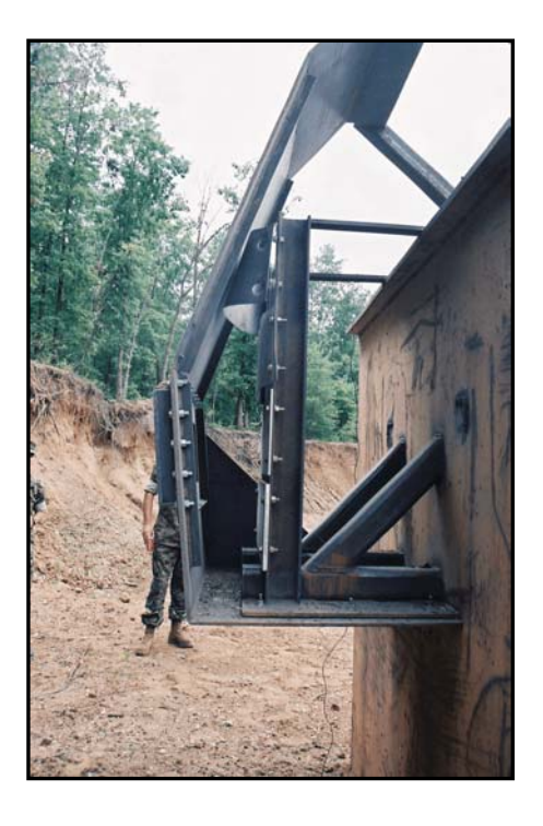
Figure 20. Witness Plates After Second Blast