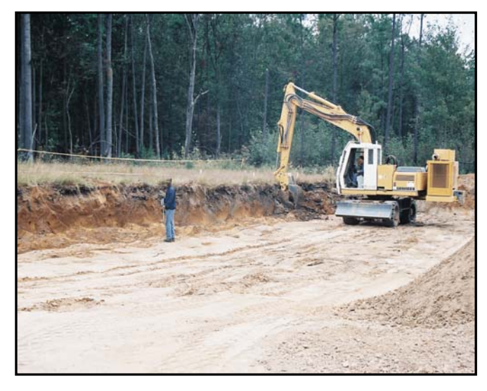
Figure 22. Blind Test - Excavation

sift the AP mines from the soils with equal performance reliability. With modifications to the excavator to make the Rotar fully functional not complete, the Bertani showed a small edge in terms of speed for sifting through piles of loose dirt and sod.