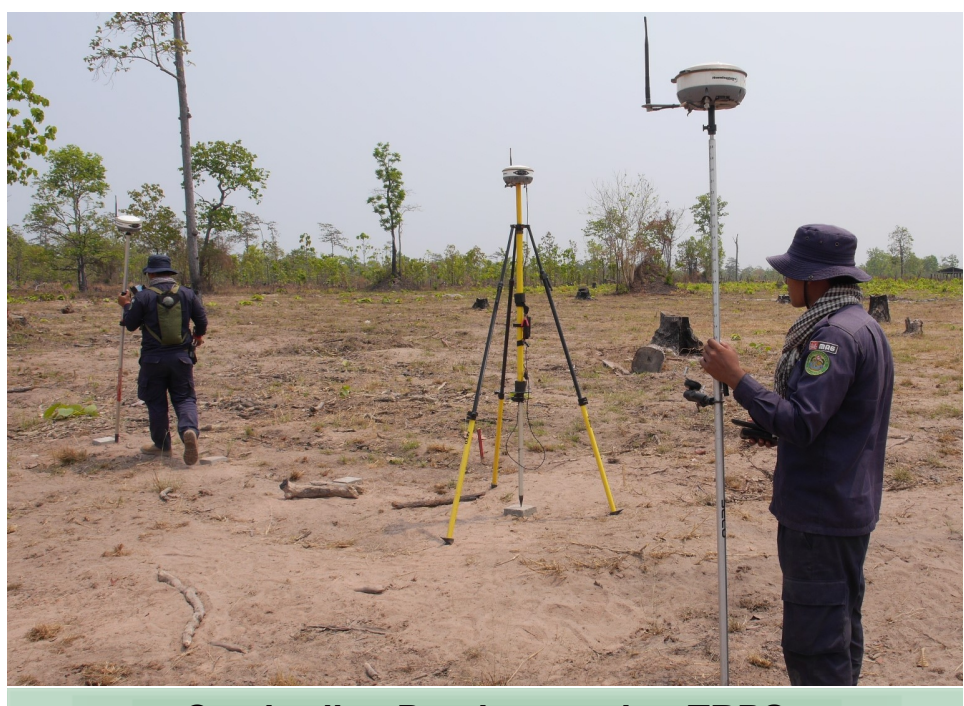
Cambodian Deminers using TRPS