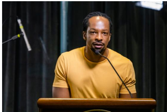
Figure 1. Jericho Brown, PhD.

possesses academic degrees distinct and different from others in this sample: MA, MFA, JD, and PhD are represented. They have interacted with Furious Flower in a variety of ways, having been featured in readings with large and small audiences and interviewed on camera for the center's archive, film projects, or the center's literary journal. Some have contributed to Furious Flower's scholarly panels and publications, and some have led workshops. All four are celebrated writers, each with multiple prestigious literary awards. All identify as Black and have taught creative writing at major universities. And although they are not the only writers who did so, these poets caught my attention while I worked at Furious Flower for their distinctive poetic voices, their engagement with other Black writers, and their credentials, as noted below.