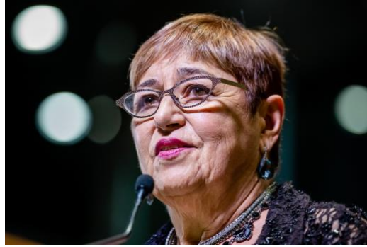
Figure 2. Toi Derricotte, MA.

Derricotte founded the Cave Canem Foundation with Cornelius Eady in 1996 “to remedy the under-representation and isolation of African American poets in the literary landscape” (Cave Canem, n.d., para. 1). Her honors include the Anisfield-Wolf Book Award, Guggenheim Fellowship for Creative Arts, PEN/Voelcker Award, Pushcart Prizes, and National Book Award (finalist). She is Professor Emerita at University of Pittsburgh ( toiderricotte.com ).