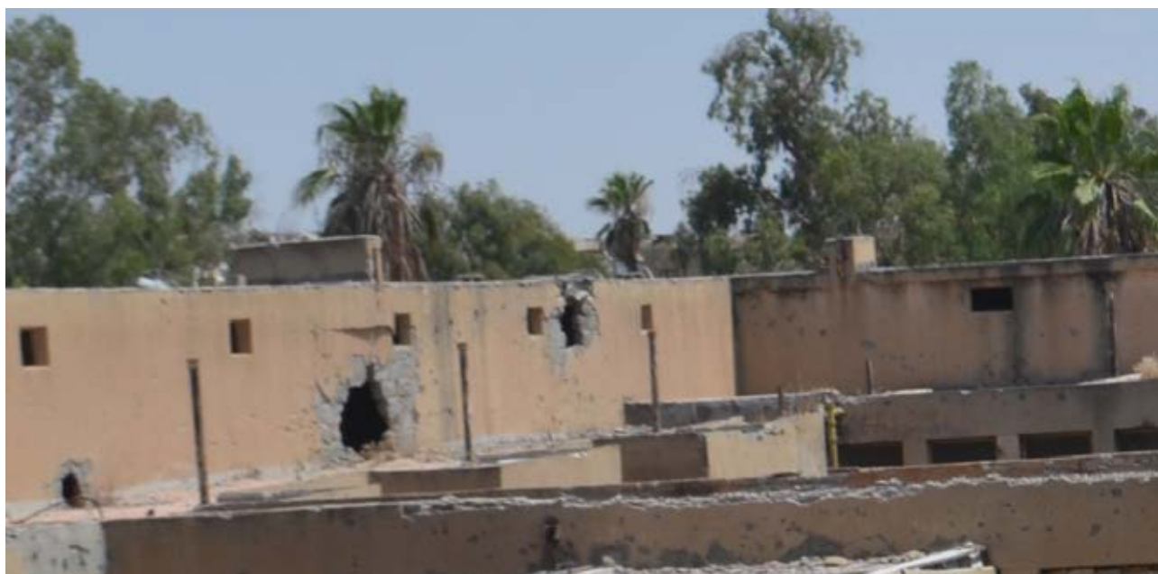
© Bahia.Z / HI - Syria, 2019