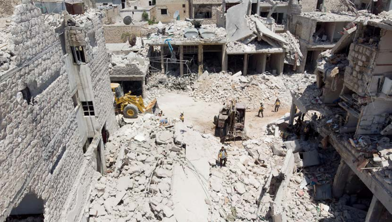
Syria, 2019

school dropout rate reached almost half of all students (44%), compared to gross enrollment rates in Syria of 91% in 1996. 114 The impact of this “lost generation” will be felt in Syria for decades to come.