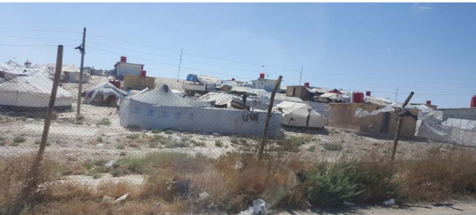
© A. Taslidžan Al-Osta/ HI - Syria, 2019

bombardment forced hundreds of thousands of Syrians to flee. 31 Many travelled to the last opposition stronghold of Idlib in the northwest, where at the time of writing over 3 million people are in need, and bombardments have reached almost daily frequency despite peace agreements. 32 The northeast of the country is held in part by the Kurds who, with the support of coalition airstrikes, defeated ISIS in Raqqa.