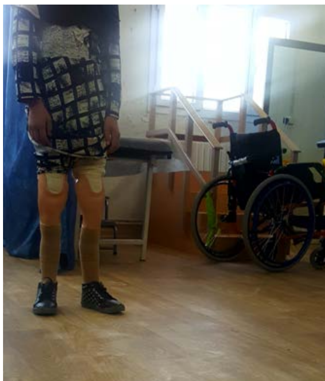
© A. Taslidžan Al-Osta/ HI - Syria, 2019

As evidenced by the high numbers of survivors sustaining lifelong impairments, any policy or framework for VA in Syria or other States must be based upon human rights, and in line with the CRPD, to which Syria is a signatory. Syria will need to be supported technically and financially to meet the requirements of the CRPD, but the social, economic and cultural inclusion of persons with disabilities is necessary to ensure all citizens can contribute to the future of Syria in a dignified and meaningful way. Efforts to update Syrian disability law and policy should be participatory and accessible, to ensure that the views of persons with disabilities are included.