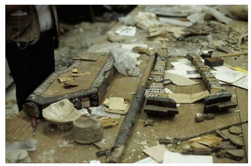
Figure 4. A badly damaged lyre of Ur.

Museum,<sup>18</sup> one is at the University of Pennsylvania's Museum of Archaeology and Anthropology,<sup>19</sup> and the great Golden Lyre of Ur (also known as the Great Bull Lyre) ended up at the National Museum of Iraq in Baghdad where it stood on display until the US-led invasion of Iraq in 2003. In early April of 2003, the museum was looted. The lyre went missing, only to be found in pieces. The irreparably damaged gold and mother-of-pearl bull's head was subsequently discovered in the flooded basement vaults of Iraq's Central Bank. Looters stripped parts of the body of much of its gold and left the remains