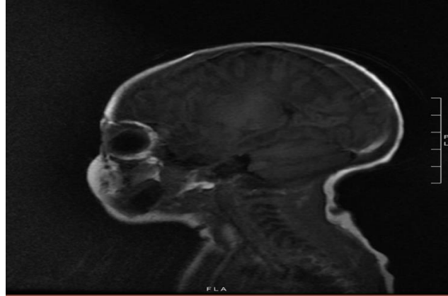
Figure 3: Sagittal ultrasound of venous sinus thrombosis

On hospital day two, the electrolyte abnormalities had been corrected and no further seizure-like activity was observed in the patient. A joint multidisciplinary decision was made to take the patient for laparoscopic pyloromyotomy.