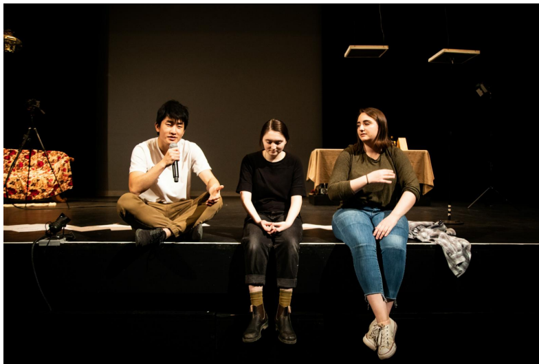
The ending in which the actors individually talk about their grandparents.

the question of “are we playing them - our grandparents and old people in general - right?” Or “do we reconnect with them by playing them?” I think it will take longer in our life to figure it out. On the other hand, we do have a lot about this topic on the mind to express as the creators of this project. As a result, I think this ending truly and sincerely reflects the current phase of our mentalities and progress in terms of this core theme of “playing and reconnecting the old generation.” We stayed true to ourselves until the end.