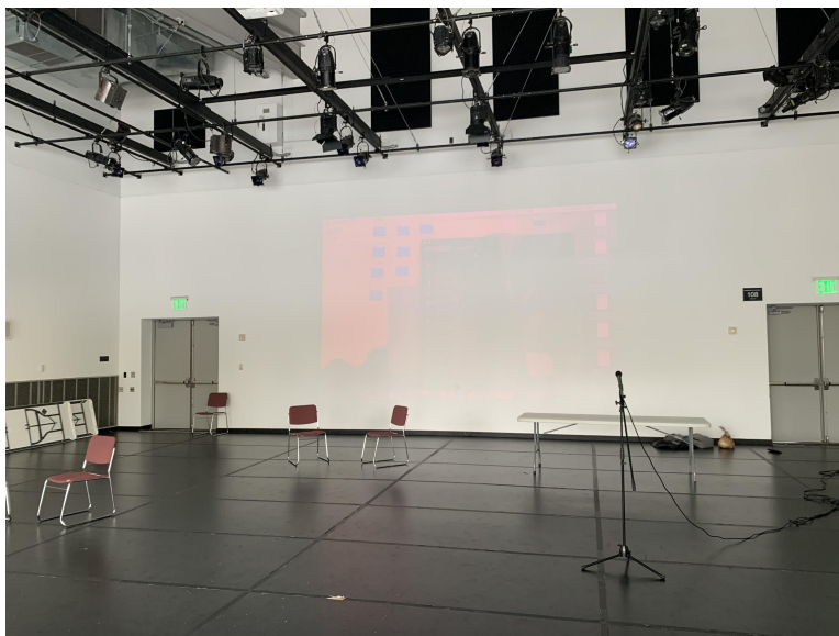
The first attempt on the full stage according to this draft. Credit to Yibin Wang

Under the form of ritual and direct communication with the audience, I divided the stage into four areas and each one has its clear function: observer area (downstage left), speech area (downstage right), Brooke's filming area (upstage left), and Henry's filming area (downstage right). This structure and settings were shown in the mid-way showing and worked really well.