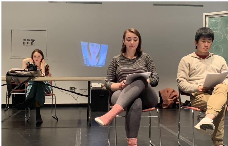
One of the staging examples of what we have tried for the first scene in a rehearsal.