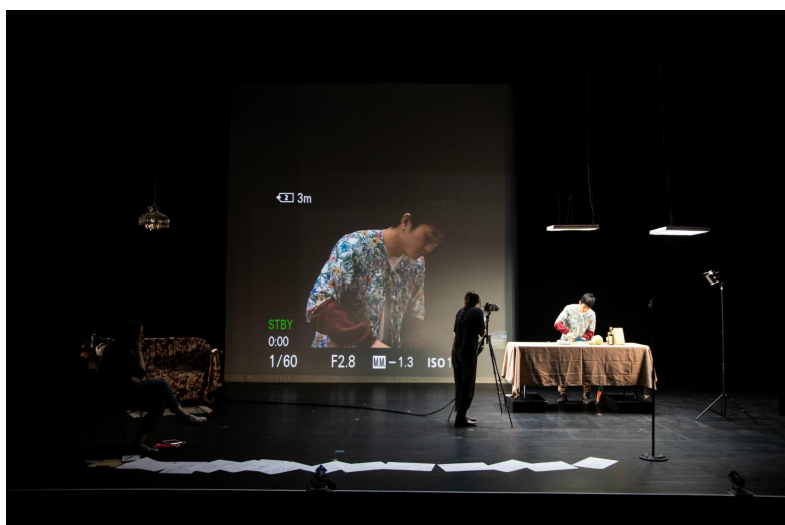
The significant technical aspect of this piece supported by the team.