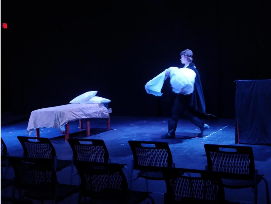
The Phantom of the Opera