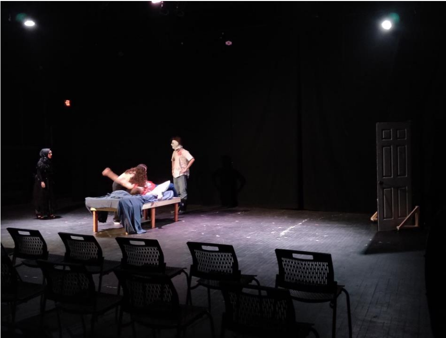
Final Girl Mash Up