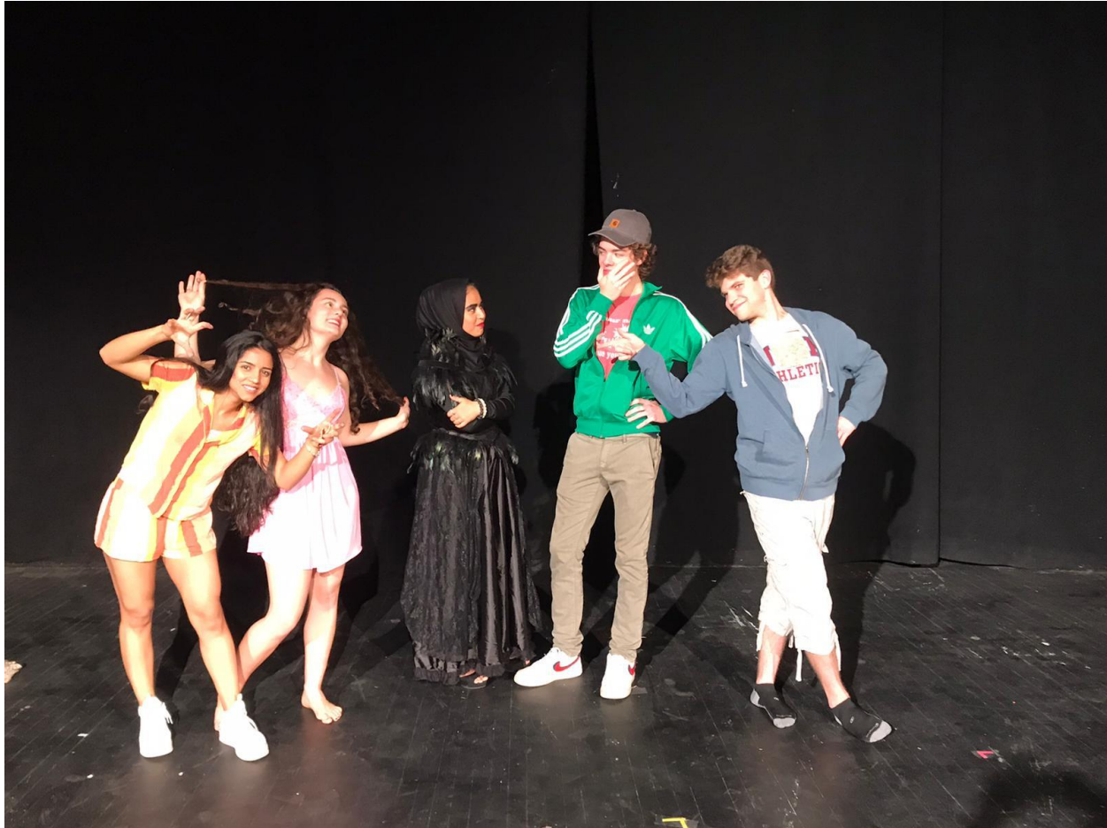
The cast of Movie Macabre