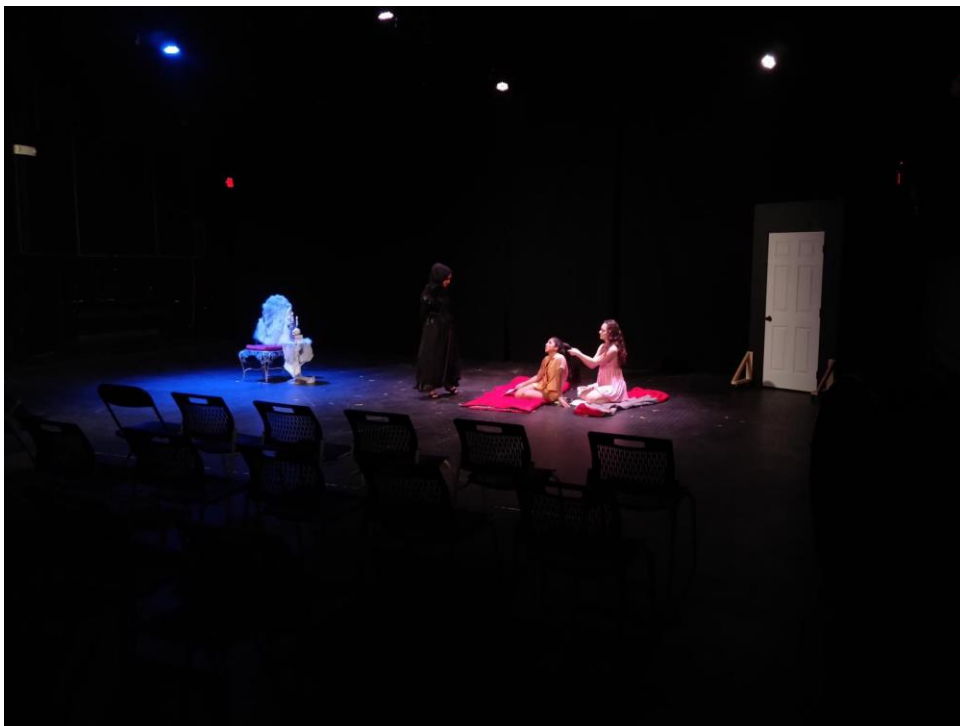
Vampirella observing a poorly made B grade horror movie