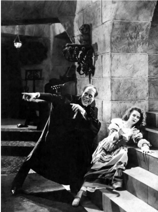
The 1925 silent film version of The Phantom of the Opera