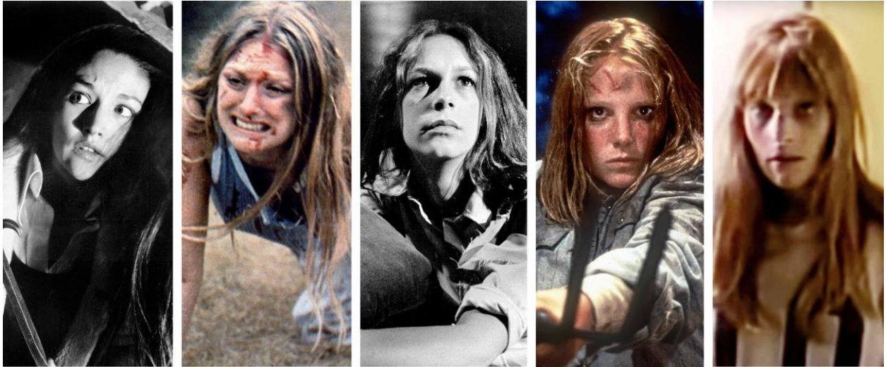
Just a few of the many final girls. These five are from of horror movies of the 70s, 80s and 90s