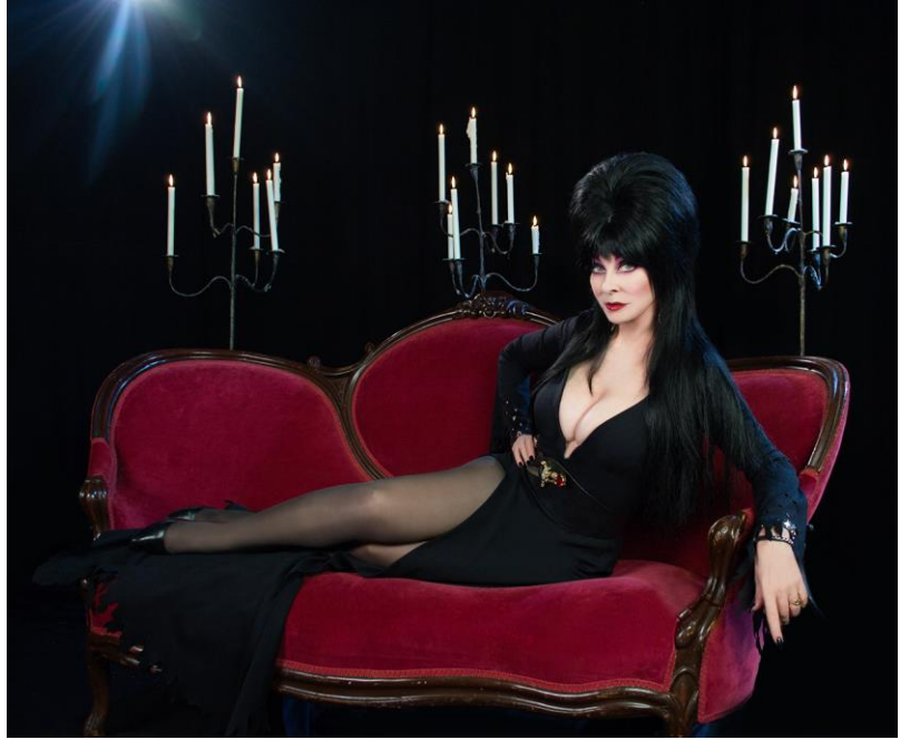
Vampira (Left) and Elvira, Mistress of the Dark (Right)