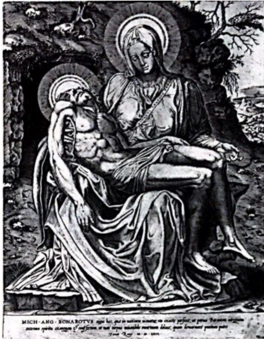
Figure 11. Adamo Ghisi. Print after Michelangelo's Pietà . 1566. Print. (From Leo Steinberg, Michelangelo's Sculpture: Selected Essays , 5)