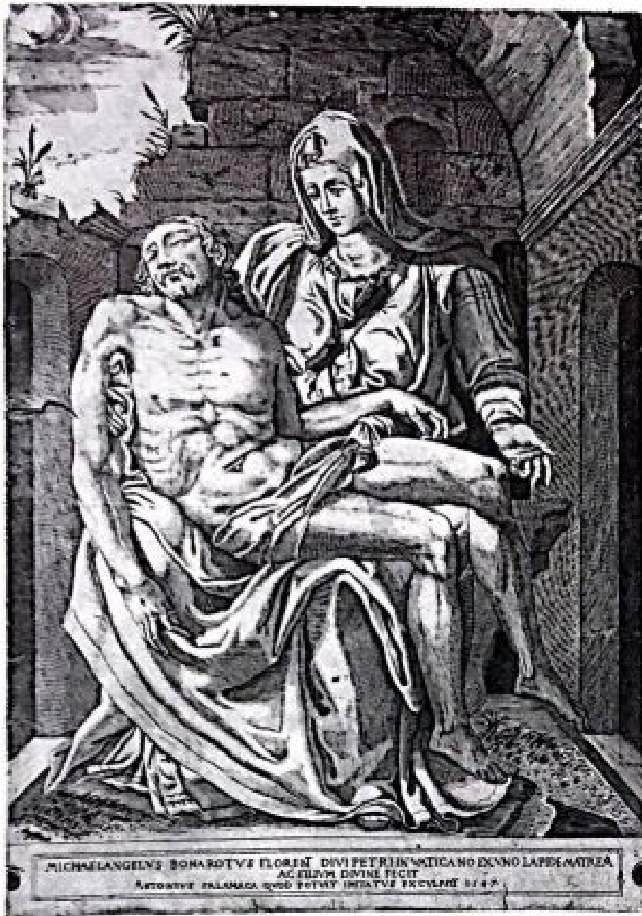
Figure 10. Antonio Salamanca. Print after Michelangelo's Pietà . 1547. Print. (From Leo Steinberg, Michelangelo's Sculpture: Selected Essays , 5)