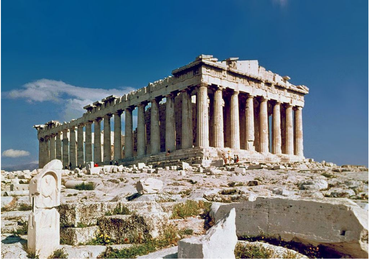
Figure 15. Parthenon. 438 BC. Architecture. Athens, Greece