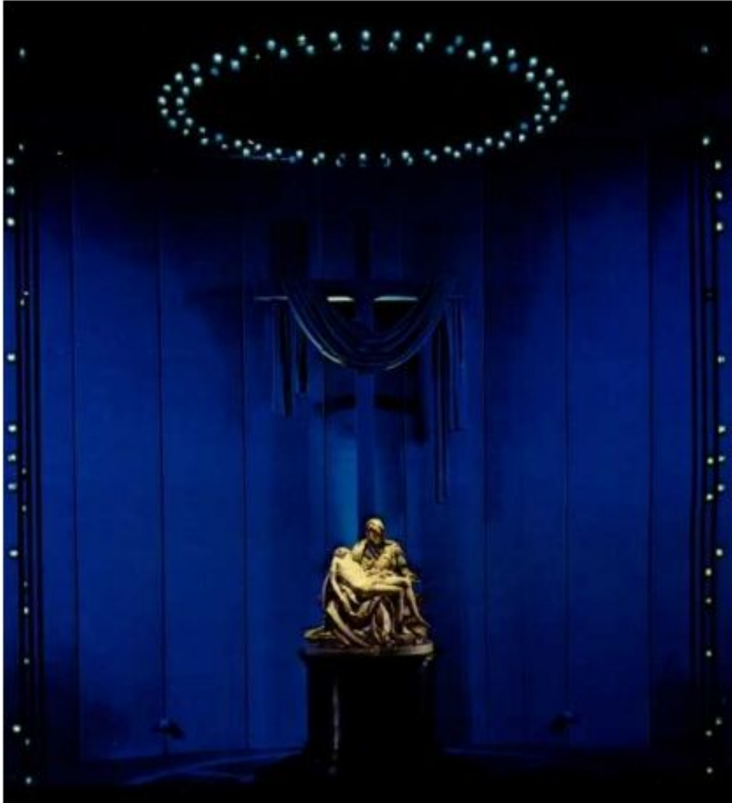
Figure 13. Michelangelo's Pietà in the Vatican Pavilion. (October 13, 2007. Photograph. Accessed April 29, 2020. http://www.nyu.edu/classes/bkg/wf/blog/2007/10/the_pieta_in_the_night_sky.html .)