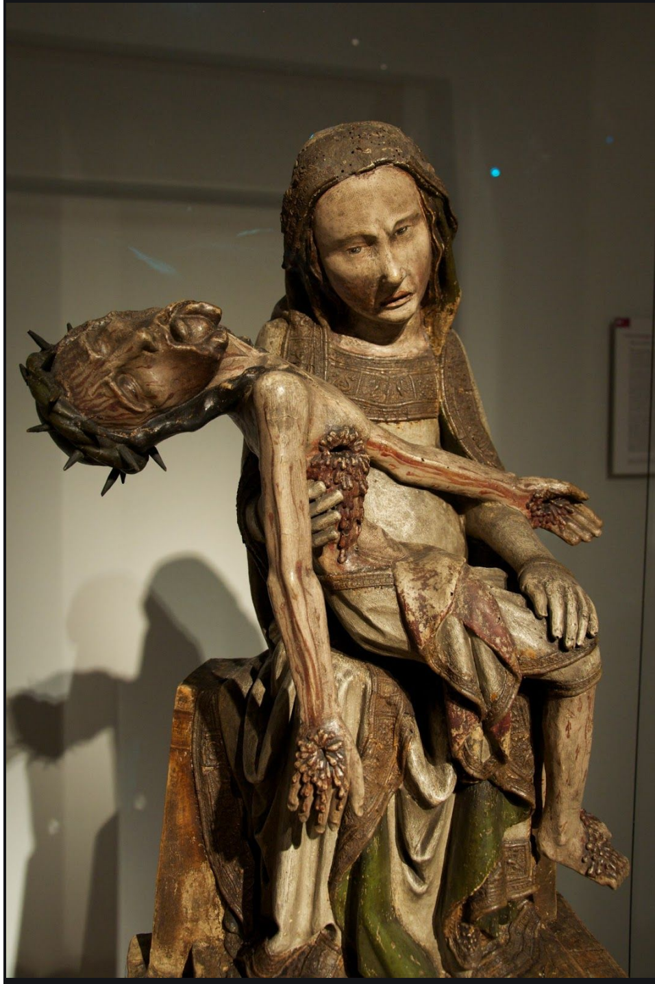
Figure 5. Röttgen Pietà. c. 1360. wood. In Rheinisches Landesmuseum, Bonn, Germany.