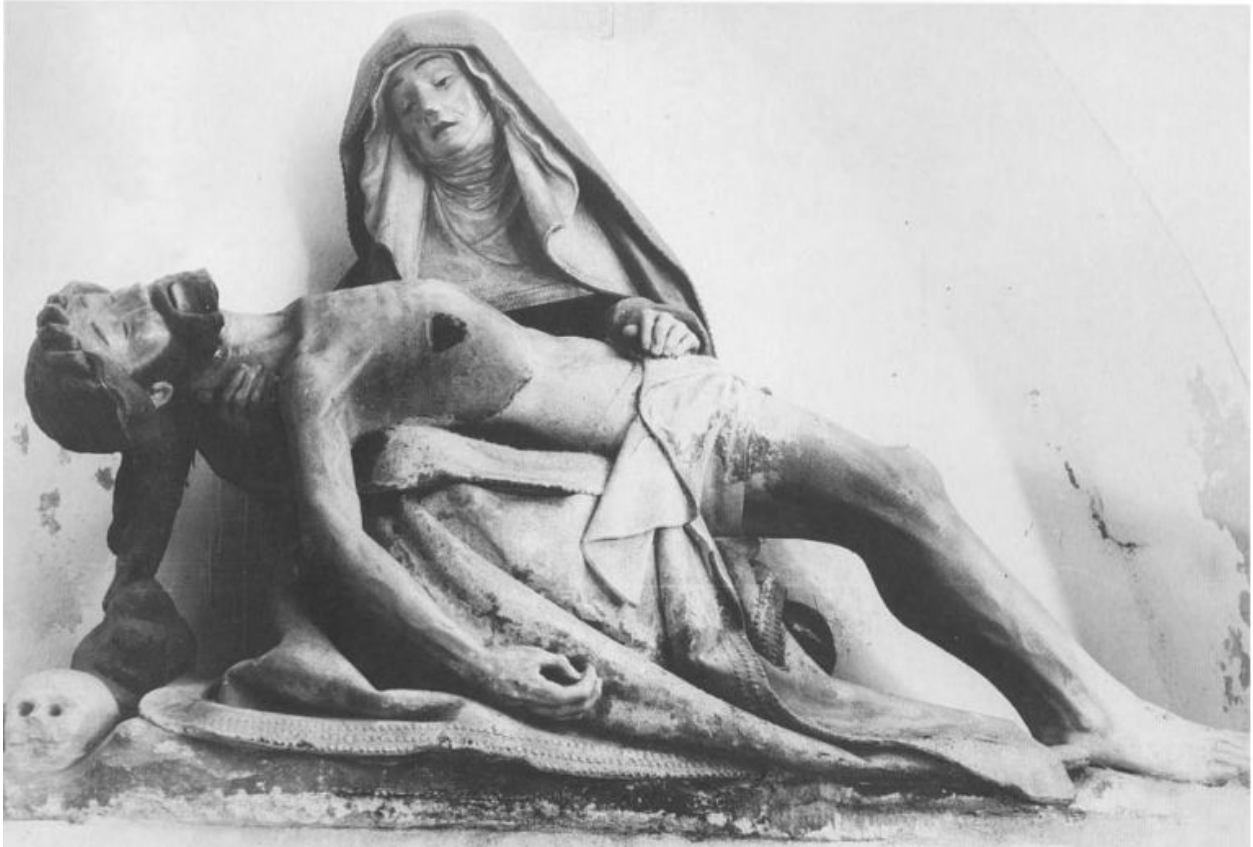
Figure 9. Pietà . Saint-Aulaire, in church. (From William H. Forsyth, The Pietà in French Late Gothic Sculpture: Regional Variations , 122)