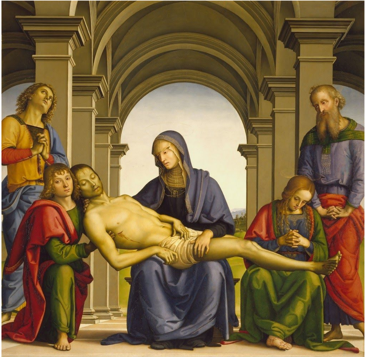
Figure 6. Perugino. Pietà. Late 1490s. Tempera on Panel. In the Uffizi Gallery, Florence, Italy.