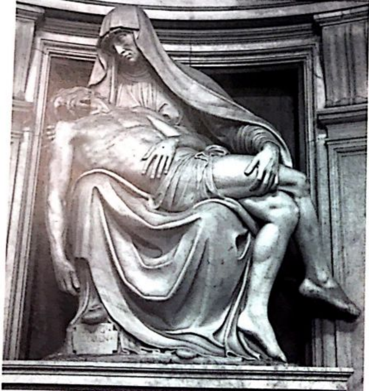
Figure 8. Giovanni Montorsoli. Pietà . 1543-46. Marble. (From Leo Steinberg, Michelangelo's Sculpture: Selected Essays , 4)