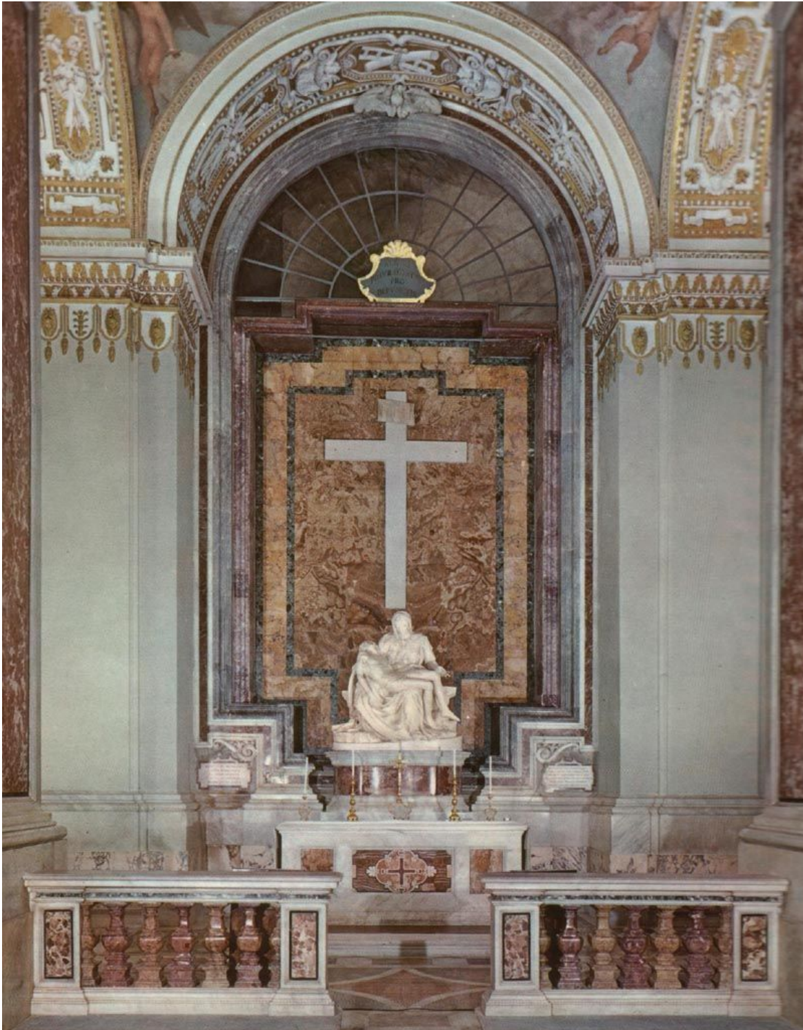
Figure 4. Michelangelo's Pietà in Chapel of the Pietà, St. Peter's Basilica, Vatican. ( The Pietà . Photograph. Accessed May 1, 2020. http://stpetersbasilica.info/Altars/Pieta/Pieta-chapel.jpg )