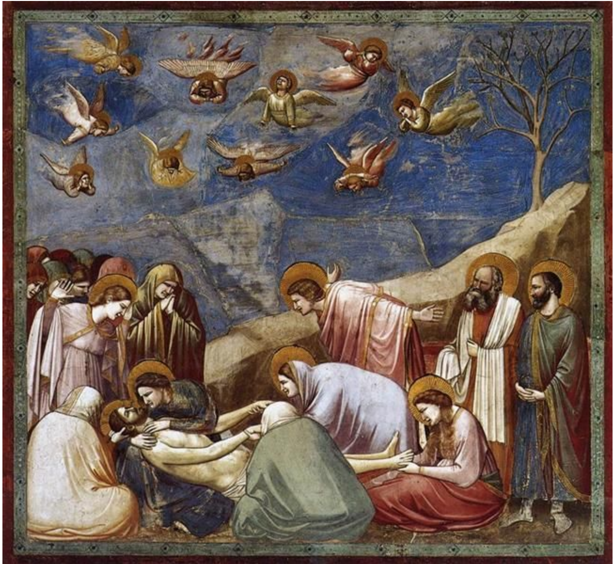
Figure 3. Giotto. Lamentation . c.1304-c.1306. Fresco. In Scrovegni (Arena) Chapel, Padua, Italy. (Lamentation (The Mourning of Christ), photograph, Wikiart, accessed April 30, 2020, https://www.wikiart.org/en/giotto/lamentation-the-mourning-of-christ-1306-1 .)