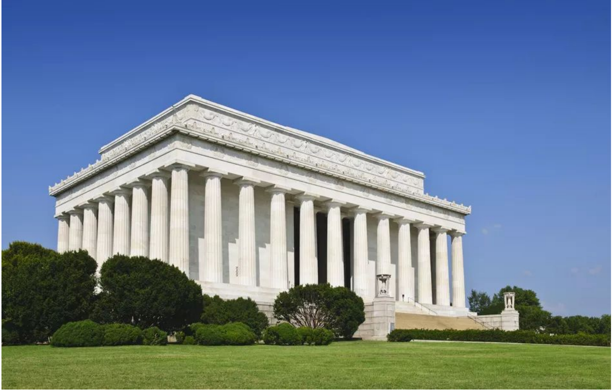
Figure 14. Henry Bacon. Lincoln Memorial. 1922. Architecture. Washington, D.C. (Tetra Images/Getty Images, Lincoln Memorial in Washington, D.C., photograph, tripsavvy, June 7, 2019, accessed May 2, 2020, https://www.tripsavvy.com/lincoln-memorial-photos-1039261 .)