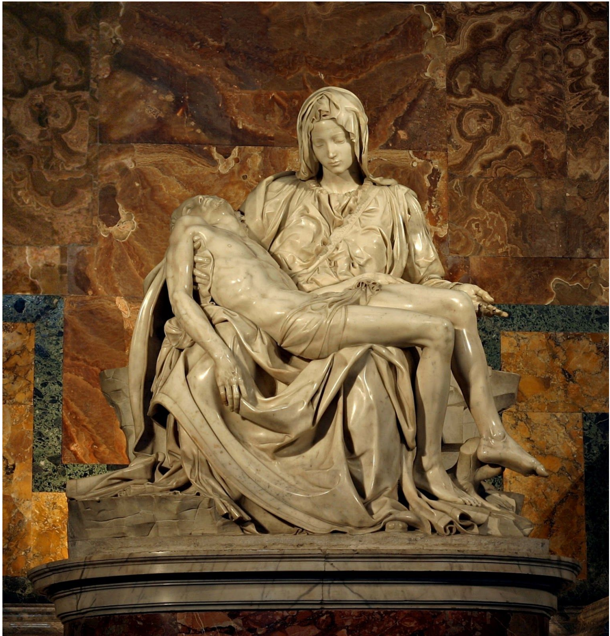
Figure 1. Michelangelo Buonarroti. Pietà . 1499. Alabaster. In St. Peter's Basilica, Vatican. ( Pietà , photograph, Wikiart, accessed April 30, 2020, https://www.wikiart.org/en/michelangelo/pieta-1499 .)