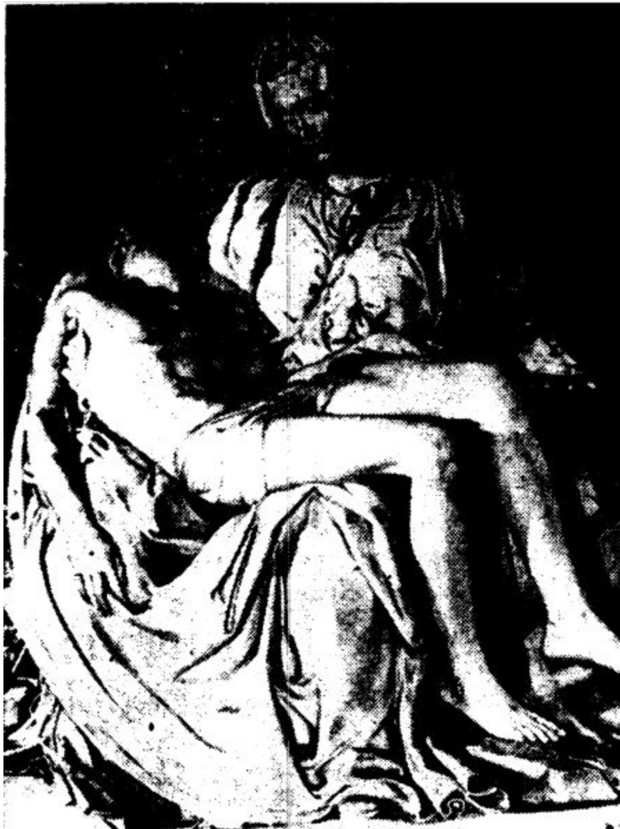
Michelangelo's "Pietà," which will be exhibited at the Holy See pavilion at the 1964-65 New York World's Fair.

Figure 12. Photograph of the Pietà on NYT article. (Michelangelo's "Pietà." March 1964. Photograph. Accessed April 29, 2020. https://search-proquest-com.ezprox.bard.edu/hnpnewyorktimes/docview/116029691/E8AF2FCCB8014FC9PQ/1?accountid=31516. )