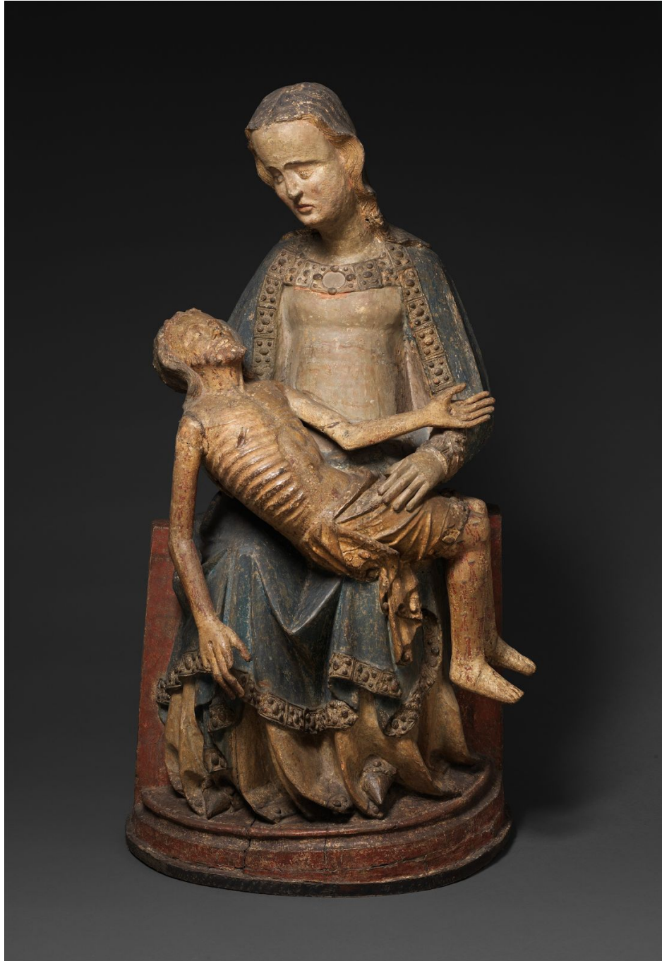
Figure 2. Vespervilder. 1375-1400. Wood. In the Metropolitan Museum of Art, NY.