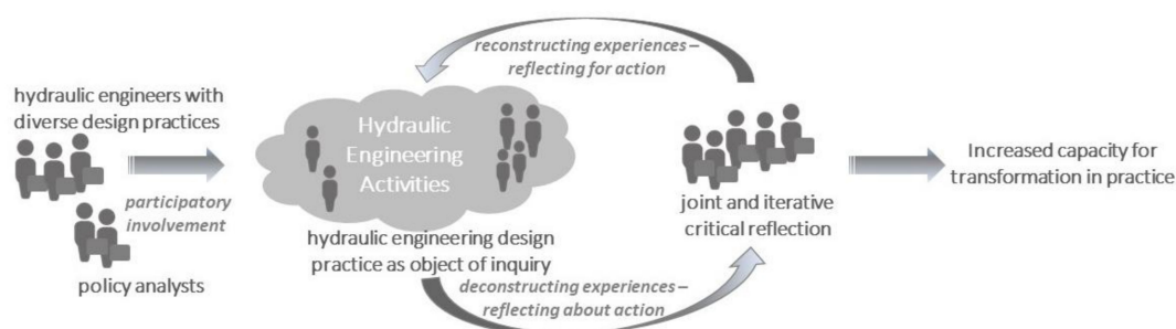
Figure 1. The method of critical reflection employed in this study.

As policy scientists working closely with coastal and river engineers from 2013 onwards, we employed the method of critical reflection (Figure 1), which, through reflection about action, seeks to initiate reflection for action [15,17]. According to Fook [17], critical reflection can free us from restrictive ways of knowing and indicate potential avenues for change. Indeed, Morley [18] claims that critical reflection allows us to research ways to promote congruence between practice-based aims and the ways we actually engage in practice.