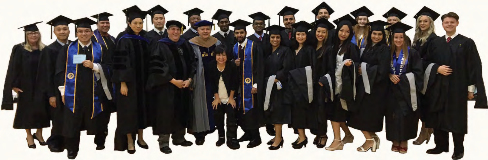
MSA graduates, faculty, and staff excited about the hooding ceremony!

Congratulations to each of you. We are very proud of everyone's accomplishments and wish each of you continued success as ERAU alumni!