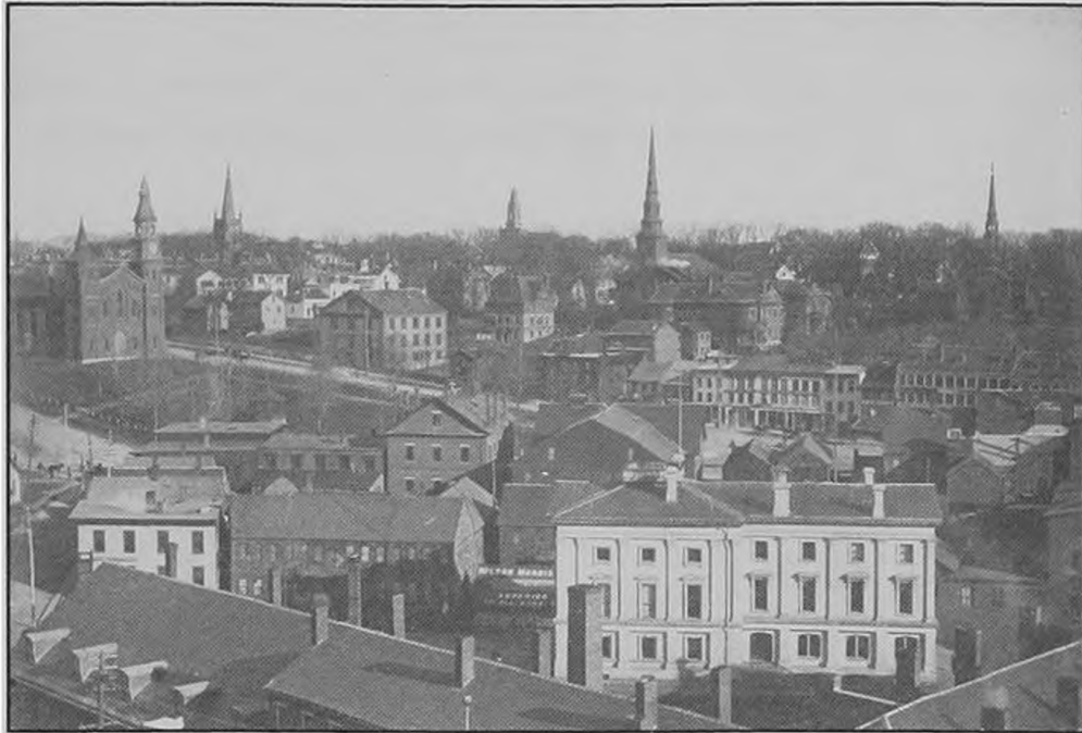
Franklin Muzzy and Company (second building from the left beyond the roof in the lower border of the photo) became one of Bangor's most successful industrial establishment.

all mechanics by providing programs to improve skills, morals, and general education. In weekly meetings, debates, and lectures, the association stressed traditional values, such as success for the industrious and the dignity of skilled labor, but it also kept the members abreast of the latest scientific developments related to their crafts. 31