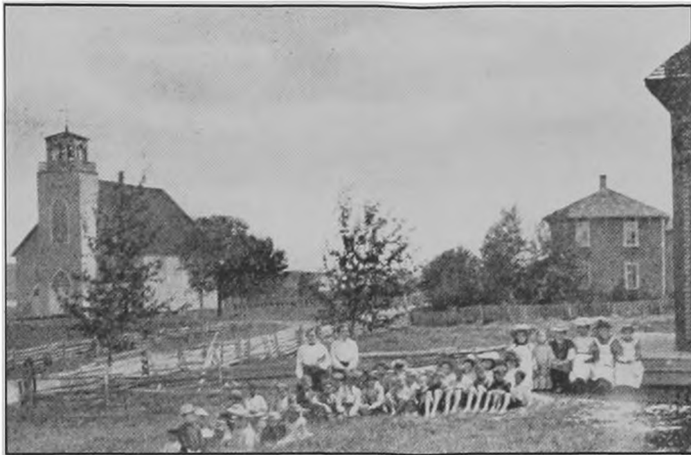
Fort Kent teachers and students. The valley's schools, becoming more American in outlook during the 1860s, helped supplant cross-border kinship and ethnic identities with a new national identity.