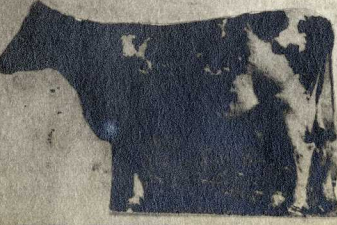
FINTRY BUMBLEBEE 153858

Note: All of above are uncompleted lactations: see number of days in milk.All are two yr. records and uncompleted.