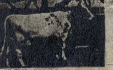
GLENGARRY'S KATHY'S OLIVER 132177

BARGOWER EVA 4th, IMP. -189545- 14,344 lbs. milk, 590 lbs. fat at 3 years in 365 days. 12,317 lbs. milk, 488 lbs. fat at 3 years in 305 days. 13,872 lbs. milk, 511 lbs. fat at 4 years in 365 days.