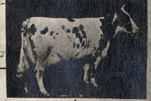
PICKEN'S LETITIA, by Netherton Masappa, another son of Terra Missis. Twice champion cow at the Canadian Royal Show for Biggs & Son. MHT-14,459 lbs. M. 565 lbs. F. at seven years.

CLASS AA Sire of 5 Class AA sons; 22 Class A. sons; 24 qualified daughters in Scotland; 38 in Canada. 1st. prize get-of-sire Royal Winter Fair 1930-31-32-34 & 36. Also Nat. Dairy PICKEN'S LETITIA