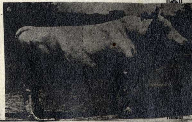
HOWIE'S FOOTPRINT, IMP.