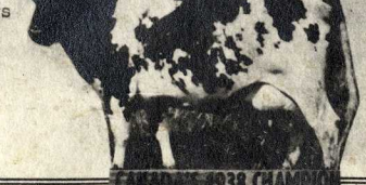
1938 CHAMPION With 945 pounds butter tested 5.06. Fintory Honeysuckle

1st. prize milking 2 yr. old Toronto Royal 1927 M. 11,456: 513: 4.48: 305