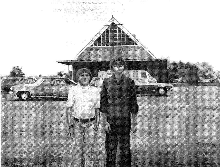
Figure 1: Wayne Adams' Church (2006) 86

Consider the sale of a work of art, such as the painting below by artist Wayne Adams, Church (2006), depicted in Figure 1 . If Adams wanted to sell the painting while retaining protections such as those contained in the Artist's Contract, he could of course have his dealer present the collector with that contract for signature. If the collector wants the art, she will sign the contract. But the enforceability will be uncertain at best, particularly as time passes and the art changes hands.