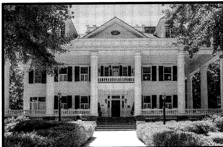
Figure 1: Twelve Oaks, the mansion that inspired Tara 12

The clearest proof that we should regard sorority houses as Confederate monuments is in their architecture. Hundreds of sororities, concentrated mainly in the South, have designed their living spaces to resemble grand plantations. 9 The stereotypic antebellum estate is familiar. Plantation homes feature white columns in the classical style, wide porticos, rigid symmetry, decorative pediments, centered entrances, evenly spaced windows with contrasting shutters, and low-pitched roofs. 10 Tara, the fictional estate from Gone with the Wind , is emblematic of the style. 11