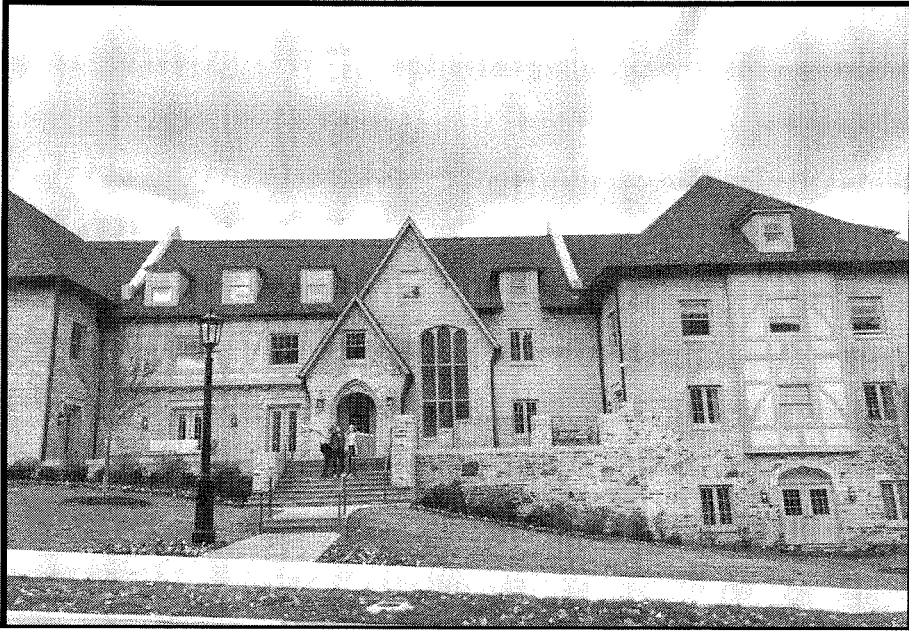
Figure 3: New Tri-Delta House at the University of Arkansas 116

The Tri-Delta chapter building, renovated in 2018, is among the very largest Greek houses in the country and has almost 100 student beds. 117 Unlike most of the sororities on the University of Arkansas campus, the Tri-Delta house does not mimic antebellum architecture. Instead, the Tri-Deltas communicate the impression of stateliness and majesty with sweeping Tudor design details. The building is widely regarded as one of the most attractive houses on campus and Tri-Delta remains one of the most sought-after houses among potential new members. The Tri-Deltas' success and the beauty of their building demonstrates that there is little reason for universities to allow sororities to build mansions that resemble slaveholders' estates.