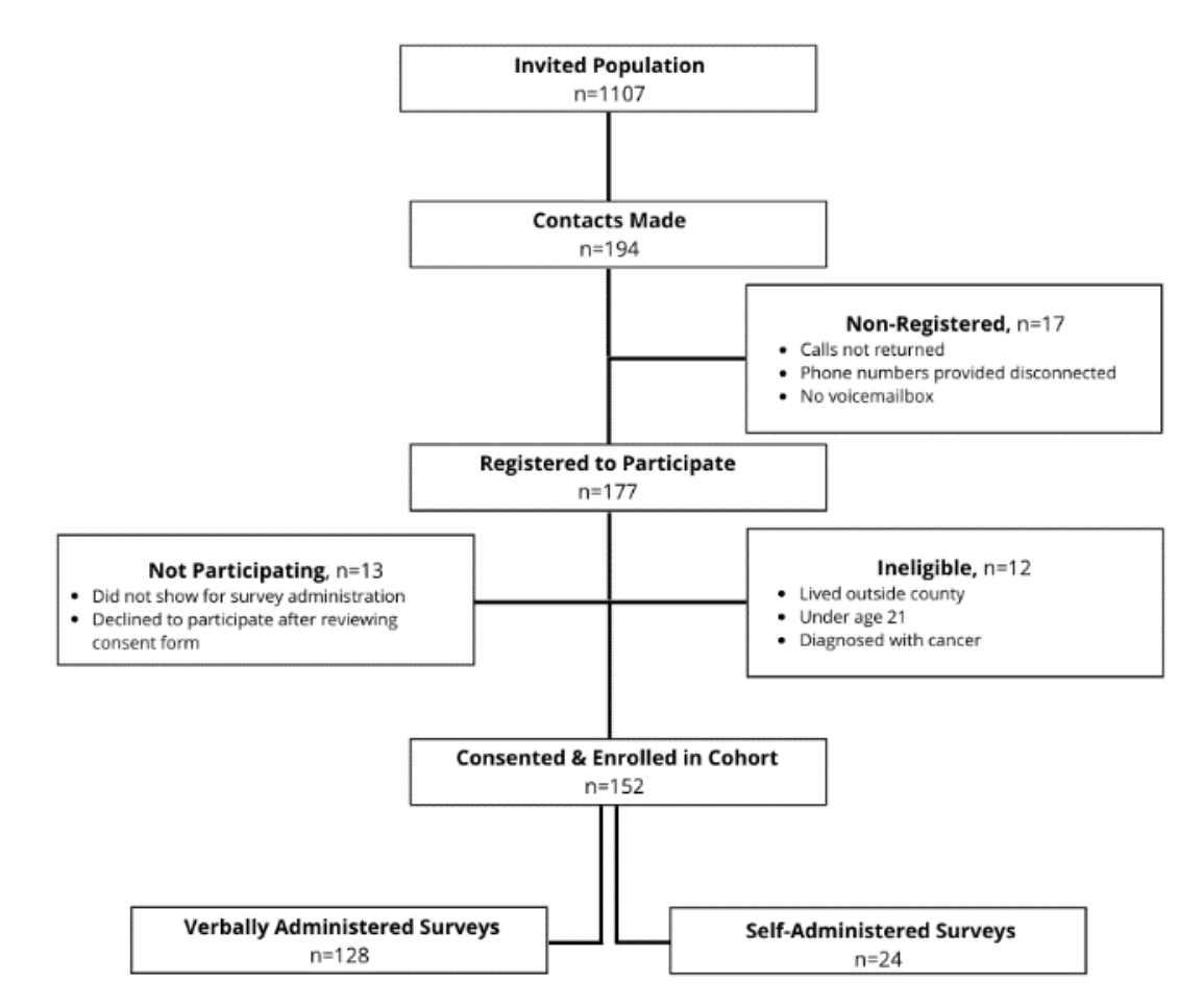
Figure 2. Prospective Cohort Recruitment Processes.

Figure 2 outlines the recruitment and enrollment process for the prospective cohort. The invited population (n = 1107) includes all engaged via Facebook and the number of promotional materials distributed through other channels. Of 194 contacts made, 177 individuals registered to participate.