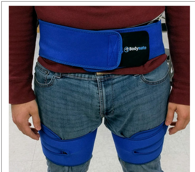
FIGURE 1 | A Hip Orthosis (BodyMate, CA, USA) fabricated from flexible, neoprene material was used to constrain the pelvic rotation.