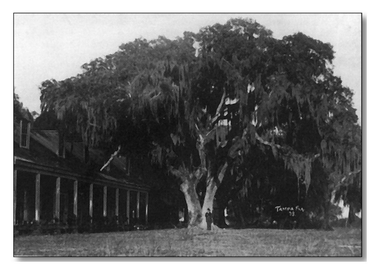
The officers' quarters of Fort Brooke in the 1890s, still beautified by huge oak trees.