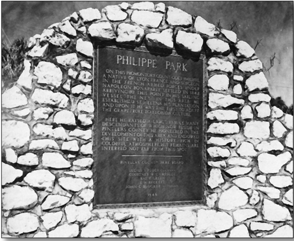
Plaque at Philippe Park in Safety Harbor.