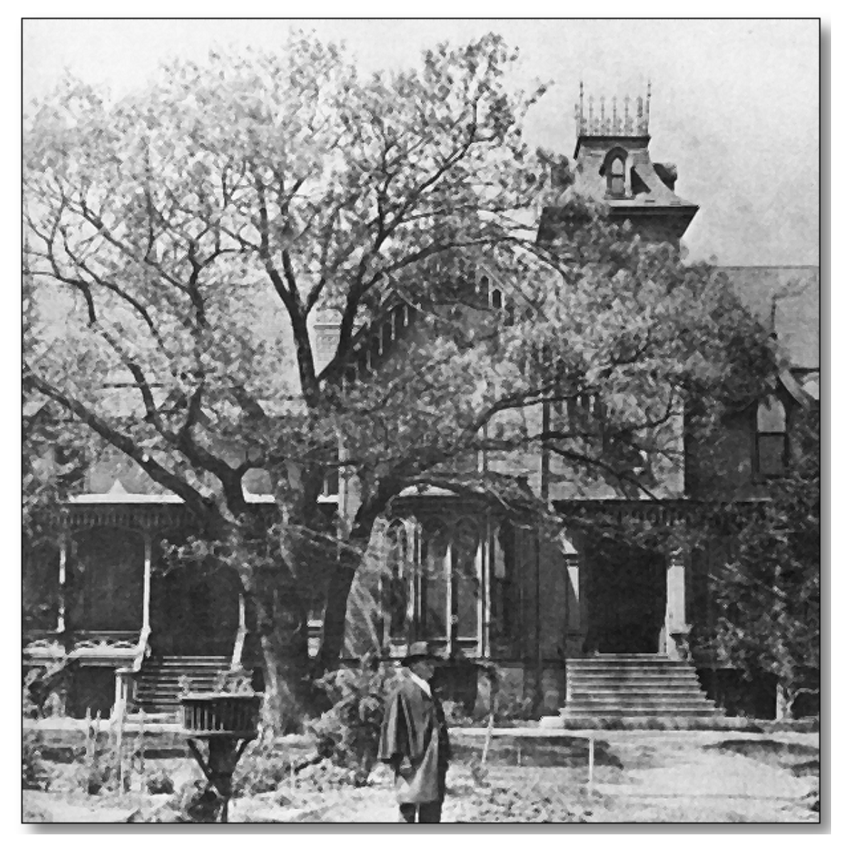
Koresh at Beth Ophra, the last home of the Koreshan Unity in Chicago, 1898.