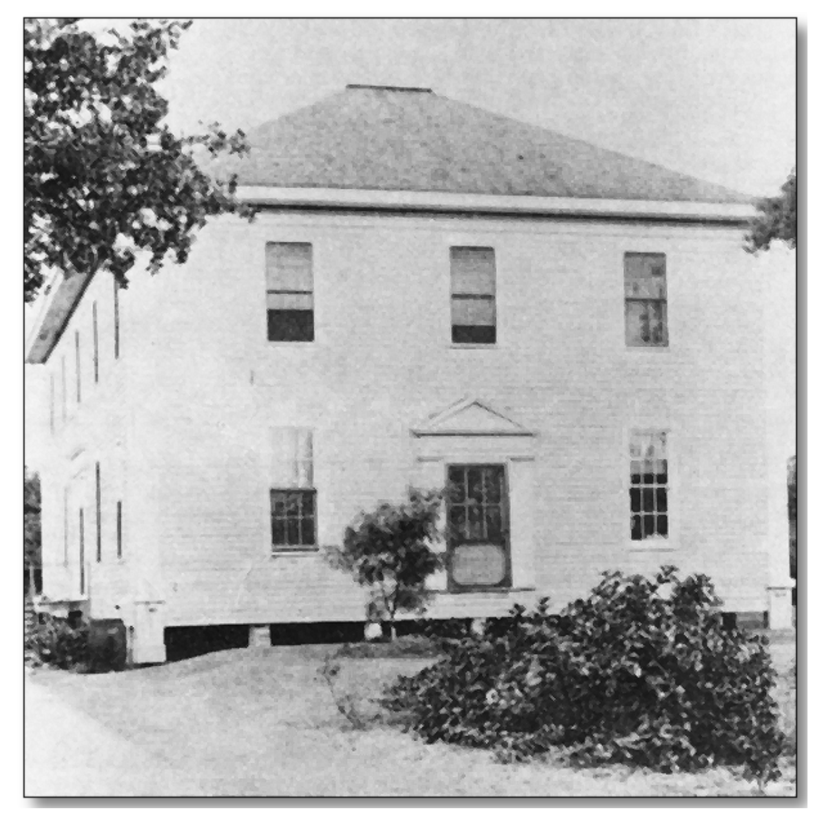
A 1903 photograph of the original headquarters of the Koreshan Unity. It was destroyed by fire in 1949.