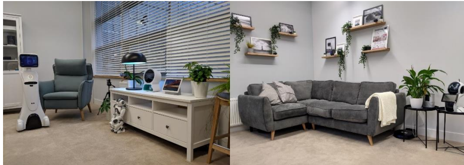
Fig. 1. Robot Home, University of Plymouth. From left to right, the robots in the picture are: AMY A1, NAO, and QBo One.

The Robot Home set up started in May 2019 and finished in September 2019. It was funded by the Interreg 2 Seas Mers Zeeën Ageing Independently (AGE'In) project. The aim of the lab design was to create a facility that follows strict care environmental guidelines for the evaluation of an HRI with seniors and vulnerable participants. A lab that will allow researchers to evaluate the acceptability and usability of AR technologies while supporting the integration of third party devices for the simulation of different scenarios related to smart homes and independent living. Figure 1 shows the lab that resembles a living room; a relatable, but a secure place that will reduce cognitive bias from experiment participants.