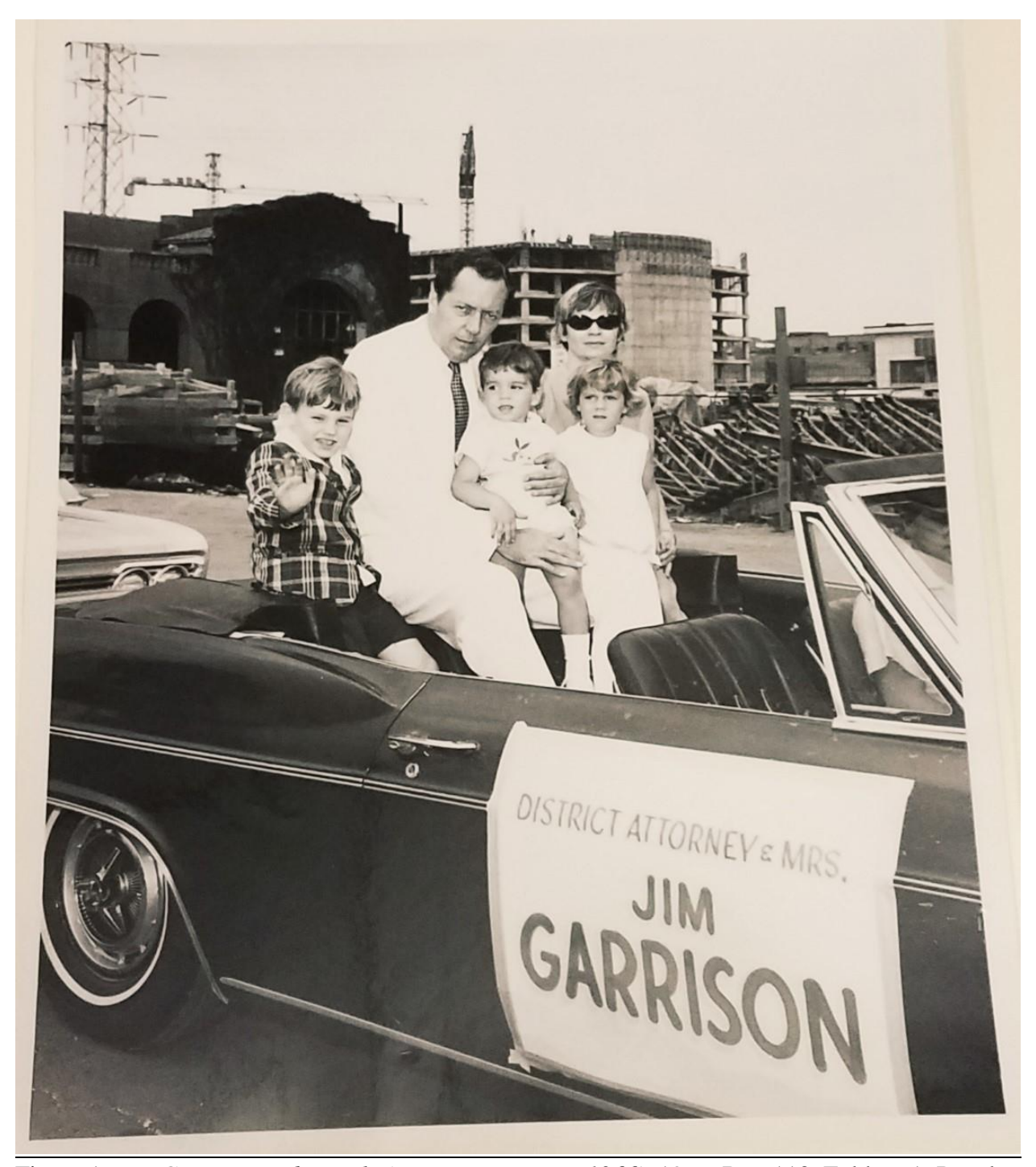
Figure 1: Jim Garrison and Family (Inauguration Day 1966) , 1966, Box 113, Folder 61: People Pictures, Victor H. & Margaret G. Schiro Papers, Tulane University Special Collections, New Orleans, LA.