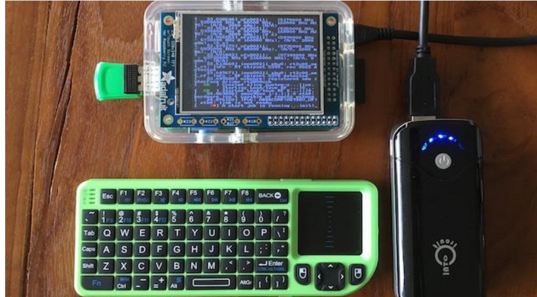
Figure 1: Raspberry Pi, mobile configuration

The Kali GNU/Linux distribution was selected as the main platform because of its well-known reputation in the security field and large user/support community. The combination of tools provides one of the most extensive collections of software security tools in one place and is available as one bootable download.