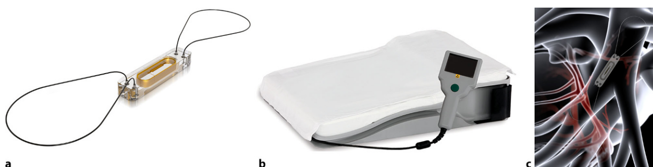
Fig. 2 a The CardioMEMS sensor (with permission of Abbott Inc.). b The CardioMEMS HF system patient unit including antenna (with permission of Abbott Inc.). c Location of the Car-

dioMEMS sensor in the left pulmonary artery (with permission of Abbott Inc.)