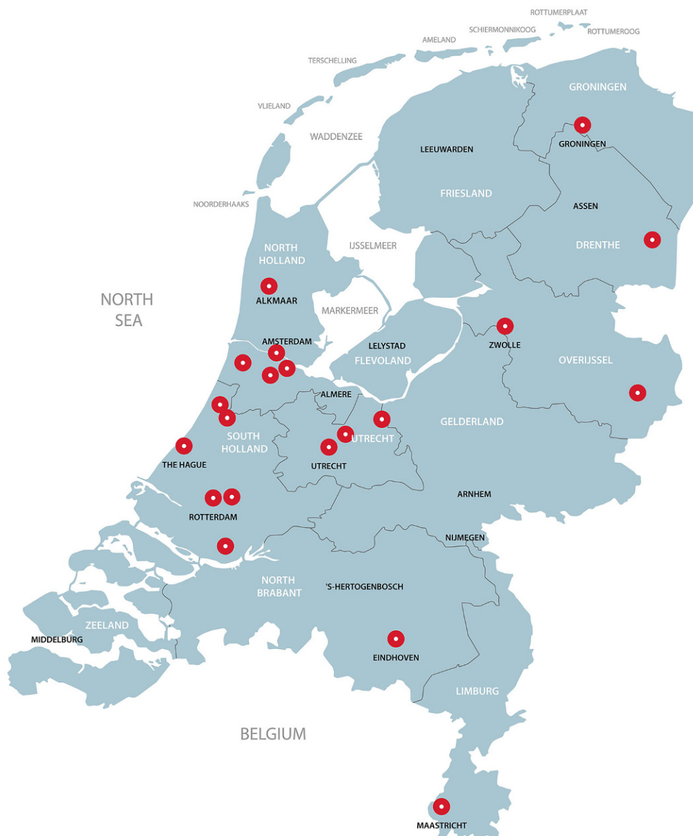
Fig. 1 Participating centres in the Netherlands

risk and safe procedure as well as the durability of the device [17–20]. Despite the innovation in patient management, several profound differences exist in the organisation of HF care (HF outpatient clinic and HF nurses), level of standard care, as well as financial structure of the health care systems in Europe and the USA, which mean that the results of this one trial cannot be translated directly. Additionally, individual trial data in a European setting are lacking and