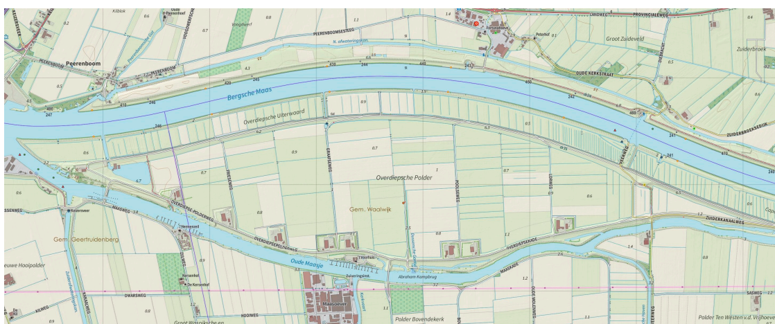
Figure 1. Map of the Overdiepse polder.