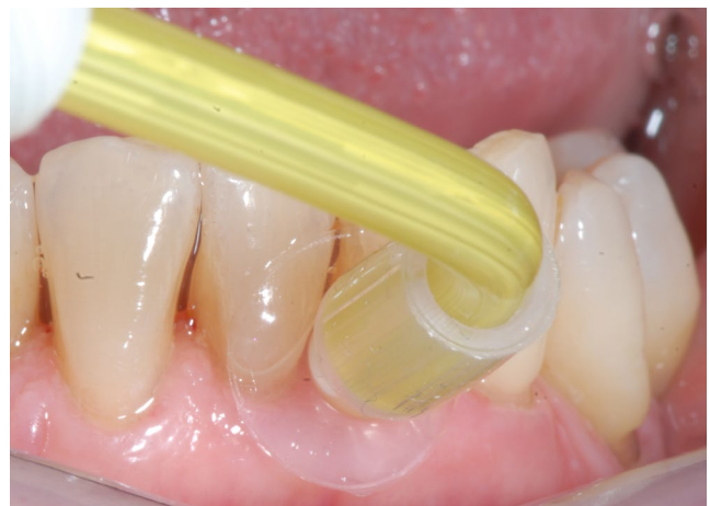
FIGURE 2 Placement of the suction cup on the approximal/interdental area/papilla

A full mouth periodontal and peri-implant chart were made prior to initial peri-implant and periodontal treatment and at T3 by one and the same examiner (DFMH). At six sites per tooth and implant (mesiobuccal, midbuccal, distobuccal, mesiolingual, midlingual, distolingual), BoP, presence of plaque (PI), SoP, and PPD were assessed