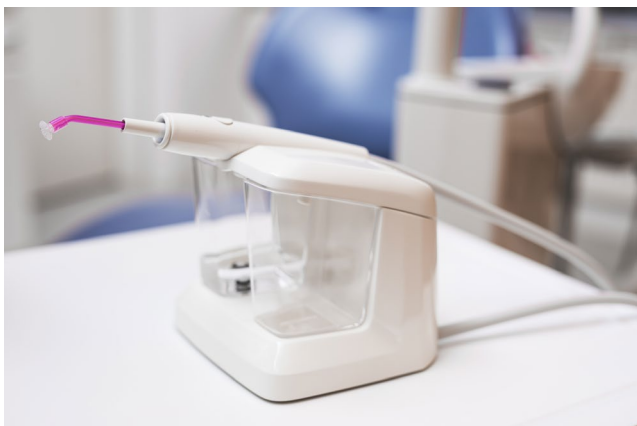
FIGURE 1 The Fluxion

The study was performed between June 2018 and March 2019 at the department of Oral and Maxillofacial surgery, at the University Medical Center Groningen (UMCG), The Netherlands. Peri-implant pockets were irrigated twice a week during a period of three consecutive weeks (six times in total). 4 Two trained dental hygienists treated all sites with peri-implantitis sub- and supragingivally. During the first treatment appointment, the remaining dentition was cleaned using an ultrasonic device (EMS®) and if needed manually with periodontal curettes (Gracey curettes; Hu-Friedy®). Patients received extensive oral hygiene instructions prior to submucosal irrigation using an electric toothbrush and interdental brushes and reinforcement took place every appointment. To ensure irrigation, care was taken to position the IED tip perpendicular to the implant axis. The submucosal sites with peri-implantitis were irrigated with water using the IED for 14 seconds (two intervals of 7 seconds; default setting IED) per site (four sites per implant, mesiobuccal, mesiolingual, distobuccal, distolingual). Clinical outcomes (bleeding on probing [BoP, %], plaque score [%], suppuration score [%], PPD [mm]), peri-apical radiographs and the presence and numbers of eight bacterial marker species were assessed at baseline (T0) and at 3 months (T3) after the