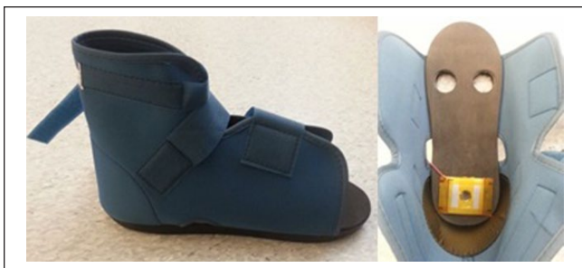
Figure 1. Actuator placed in a bandage shoe. Left: Transversal view of a (closed) bandage shoe. Right: Top view of an actuator placed inside an unfolded bandage shoe with holes in the sole. The actuator, with a 10 mm circular hole in the middle, is located at the heel placed above one of the holes in the sole of the bandage shoe in this figure. Please note that the actuator would be placed above the holes in the sole at MTP1 and MTP5 for the measurements at that location. The bandage shoe would be put on the foot of patients for measurements, and the biothesiometer placed exactly in the hole of the actuator for VPT assessment.

the actuator for VPT assessment. First, the sensation threshold for the actuator (ie, the minimum level of mechanical noise that the participant was aware of) was determined for each location separately. The output of the actuator was slowly increased until the participant indicated they did feel the noise and subsequently decreased from maximum output until the participant indicated they did not feel the noise anymore; the maximum output was the average of these two measurements. The stimulation level of the adapted actuator was set at 90% of this averaged threshold, to ensure the mechanical noise applied was subthreshold. If the maximum stimulation level was not felt, that level was used. VPT was measured three times at each location (MTP1, MTP5, and the heel) during two conditions (mechanical noise on or off). For each participant, the order of measurement conditions was determined by generating a random number (at http://www.random.org ), and following the sequence of conditions as marked by the generated number in a list with all possible sequences. Both the participant and investigator were blinded to the stimulation condition. The assistant-investigator applied the conditions in the determined sequence, while the investigator remained blinded and measured VPT. The average voltage of these measurements per location and per condition was calculated and used for further analyses.