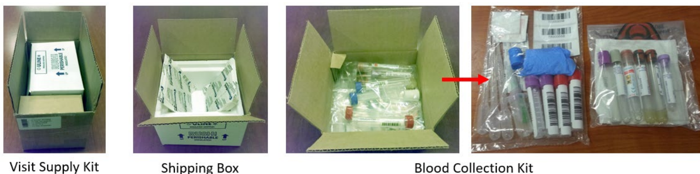
Exhibit 1. Visit Supply and Blood Collection Kits

BD Biosciences (San Jose, CA) supplied all the vacutainer and transport tubes. As of February 2018, their 3 ml EDTA vacutainer tube (Cat #367835) was no longer available, so Add Health switched to the 4 ml EDTA vacutainer tube (Cat #367844).