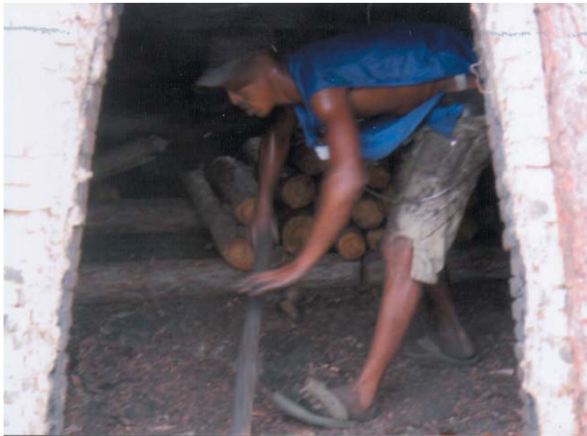
Figure 6 Filling the kiln.