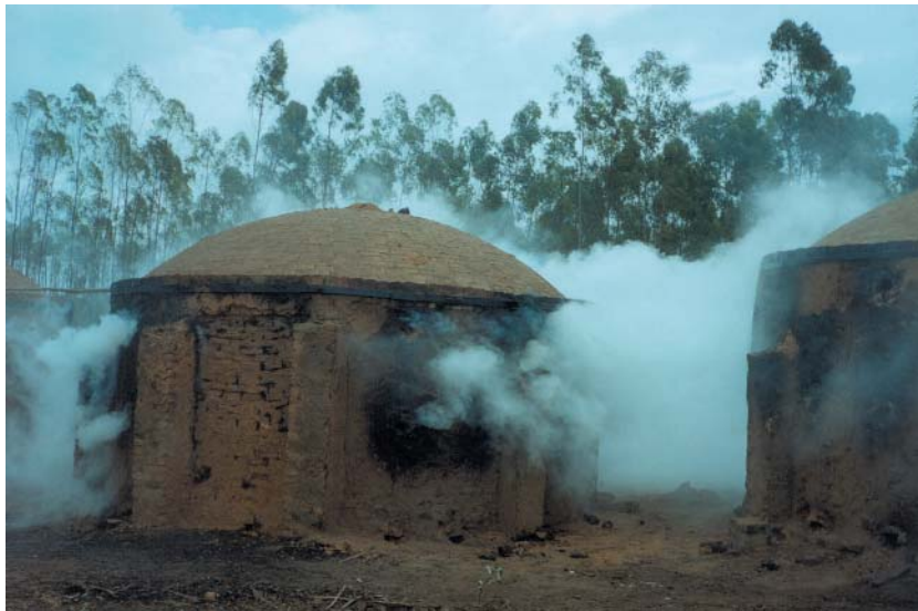
Figure 2 A kiln during a combustion process.

located far from towns, and access to them could be difficult because of poor road conditions, especially in the rainy season. Many workers shared common dormitories located inside the company perimeter, working uninterruptedly at the site for 12 days, and going home after receiving their wages once or twice a month. Logging area workers were sometimes transported by trucks or tractors to cutting areas far from the dormitories. Living conditions at most of the production sites were primitive. Running water and electricity were seldom available, and workers' food consumption was conditioned by the lack of refrigeration. Drinking water was sent in trucks, but the water used to extinguish fires and for cleaning was collected from nearby natural water sources.