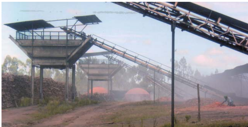
Figure 7 Silos that enable direct charcoal truck loading.

duced in some charcoal companies in northeastern Bahia State regarding living and working conditions. Brick dormitories located far from charcoal kilns and better sanitary facilities have been introduced. Periodic medical examinations have been reinforced, and uniforms and protective equipment have been delivered more consistently. However, providing personal protective equipment alone does not provide adequate protection against most of the risks present in this process. Some changes in work practices have been introduced already, such as the replacement of the manual truck loading and unloading by a mechanised process (fig 7). Starting a combustion process without climbing the kiln roof is another safety measure we recommended, but workers complained that their productivity was reduced when fire is set from the entrance opening.