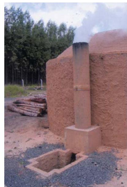
Figure 8 A kiln that enables starting fire from the bottom.

There are many other charcoal producing sites in Brazil as well as in other parts of the world, where working and living conditions can be worse than described in this article. Among small producers, smaller masonry kilns or wood pile in a pit and covered with soil may be used to produce charcoal. In these operations, the same workers might execute all of the tasks of charcoal production, with exposure to all of the accompanying hazards. Although we found only male workers in the companies we visited, entire families, including children can be found involved with the activity in other areas. Although charcoal companies in northeastern Bahia use wood from cultivated trees, a third of the national charcoal production is still based on exploitation of natural resources, depleting forests. 1 3-5 Therefore, there are also important social and environmental issues linked to charcoal production that should be taken into consideration in addition to workers' health and safety. 1