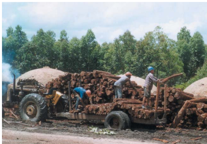
Figure 1 Unloading a tractor trailer in the kiln area.

The production sites we visited were scattered in the woods, with 5–50 workers at each site. These sites were usually