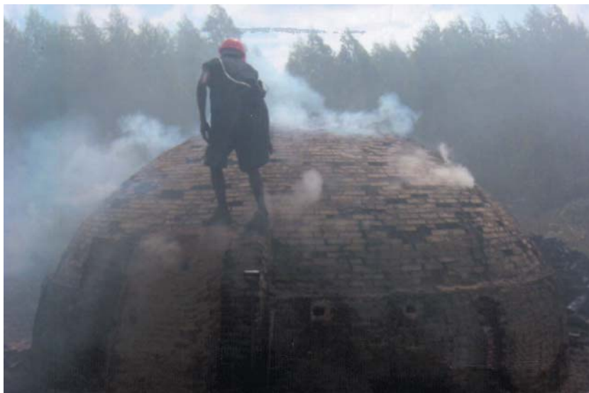
Figure 3 Climbing a kiln to check fire.

Table 1 summarises hazardous situations and potential health consequences reported by workers we interviewed. Charcoal carriers reported that the risk of injuries due to the weight and the lack of equilibrium while climbing the