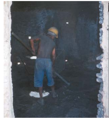
Figure 4 Taking charcoal out of a kiln.

ladder or the truck increased during rainy days, when the charcoal was soaked with water and the ladder was slippery.