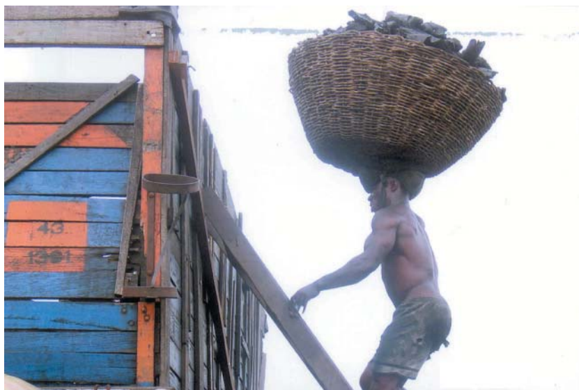
Figure 5 Loading a charcoal truck.

would tend to find some other occupation rather than making charcoal. Our observations also supported this hypothesis. Quoting some workers: “This is not a job for anybody. You have to stand the wood smoke or you just go away and look for another job.”