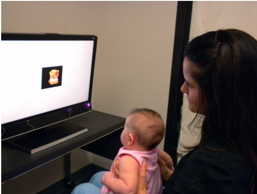
Figure 2. A child may sit on the lap of the caregiver if the child requires physical assistance in sitting, or if it is necessary for maintaining compliance.