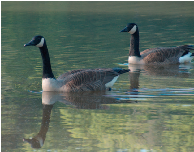
Figure. Free-living populations of Canada Geese ( Branta canadensis ) can serve as reservoirs of antimicrobial-resistant bacteria such as Escherichia coli .

Carolina, bird samples were pooled and transported to the laboratory on ice in sterile, plastic bottles and stored at 4°C overnight. A 1-g sample of guano was diluted in sterile phosphate-buffered saline, and 3 separate dilutions were filtered through 47-mm, 0.45- \mu m pore-size, gridded cellulose ester filters. After overnight culture on mFC agar plates at 37°C, filters containing a countable number of fecal coliform colonies (20–100 CFUs) were transferred to plates containing nutrient agar and 4-methylumbelliferyl- \beta -D-glucuronide (MUG) and incubated for an additional 3–4 h. Colonies fluorescing blue under long wavelength UV light were selected for biochemical confirmation. Up to 5 presumptive E. coli colonies were selected from each sampling round. All isolates were identified to genus and species level with the Vitek System (bioMérieux Vitek, Hazelwood, MO, USA).