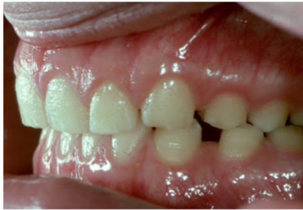
Fig. 5. The generalized thin enamel in this affected individual has a rough pitted surface that results from an ENAM mutation producing a dominant negative affect. [Color figure can be viewed in the online issue, which is available at www.interscience.wiley.com .]