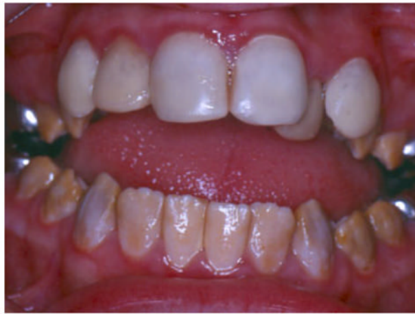
Fig. 6. The autosomal recessive pigmented hypomaturation phenotype produced by a MMP20 mutation characterized by teeth that have reduced mineral content and have a white-to-brown discoloration [Kim et al., 2005b]. [Color figure can be viewed in the online issue, which is available at www.interscience.wiley.com .]