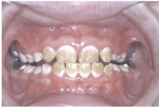
Fig. 2. Point AMELX mutations altering the tyrosine rich region of the amelogenin protein cause hypomaturational of the enamel producing the characteristic white cervical opaque and coronal brown discoloration of the enamel, as seen in this male with a P70T mutation. [Color figure can be viewed in the online issue, which is available at www.interscience.wiley.com .]