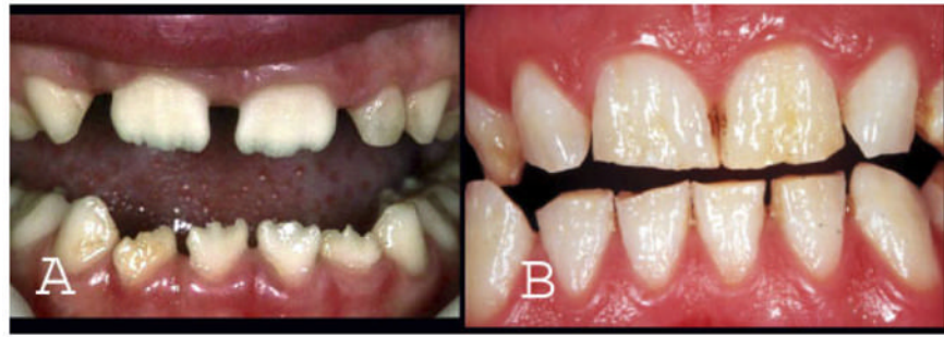
Fig. 3. AMELX mutations affecting the C-terminus of the amelogenin protein cause a marked generalized decrease in enamel thickness in males ( A ) and produces vertical grooves in females due to Lyonization, as seen in the dentition of this heterozygous female ( B ). [Color figure can be viewed in the online issue, which is available at www.interscience.wiley.com .]