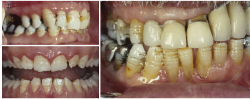
Fig. 4. Autosomal dominant ENAM mutations associated with haploinsufficiency produce a local hypoplastic phenotype characterized by horizontal bands of pits that occur at the same height on the crowns of all teeth despite their marked difference in chronological development as seen in the teeth of this affected individual [Mardh et al., 2002]. [Color figure can be viewed in the online issue, which is available at www.interscience.wiley.com .]