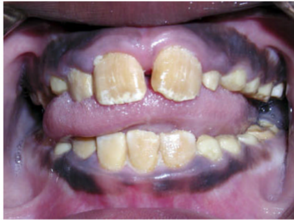
Fig. 7. Autosomal recessive pigmented hypomaturation resulting from a KLK4 mutation is characterized by enamel of normal thickness that has a marked orange–brown discoloration, as seen in this affected female. [Color figure can be viewed in the online issue, which is available at www.interscience.wiley.com .]