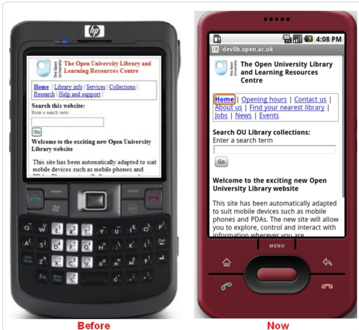
Figure 1: The Library Website - Original and Revised Versions

The touch screen phone market (e.g. iPhone and Android) is expanding quite rapidly, causing a reduction in the cost of handsets, mainly due to the competitive market and frequent releases of new phone models. According to the latest forecast by BMO Capital's Keith Bachmen (Hadar, 2008), Apple will sell 26 million iPhones (4.3 million more handsets than the forecast for 2009) by the end of 2010. As iPhone and Android handsets are becoming relatively affordable, we have been observing (through our Google Analytics website stats) a steady growth in the number of our students using them and accessing Library resources through these phones. Based on those stats and user feedback, we're now working to develop a dedicated version of our Library website and some other Library services for iPhone and Android platforms. The new system would deliver a better quality user interface to our e-resources and improve the user experience by making use of the larger screen and the intuitive user interface of those touch-screen phones.